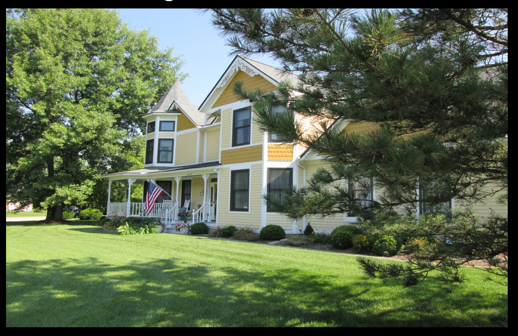
3600 Big Tree Road