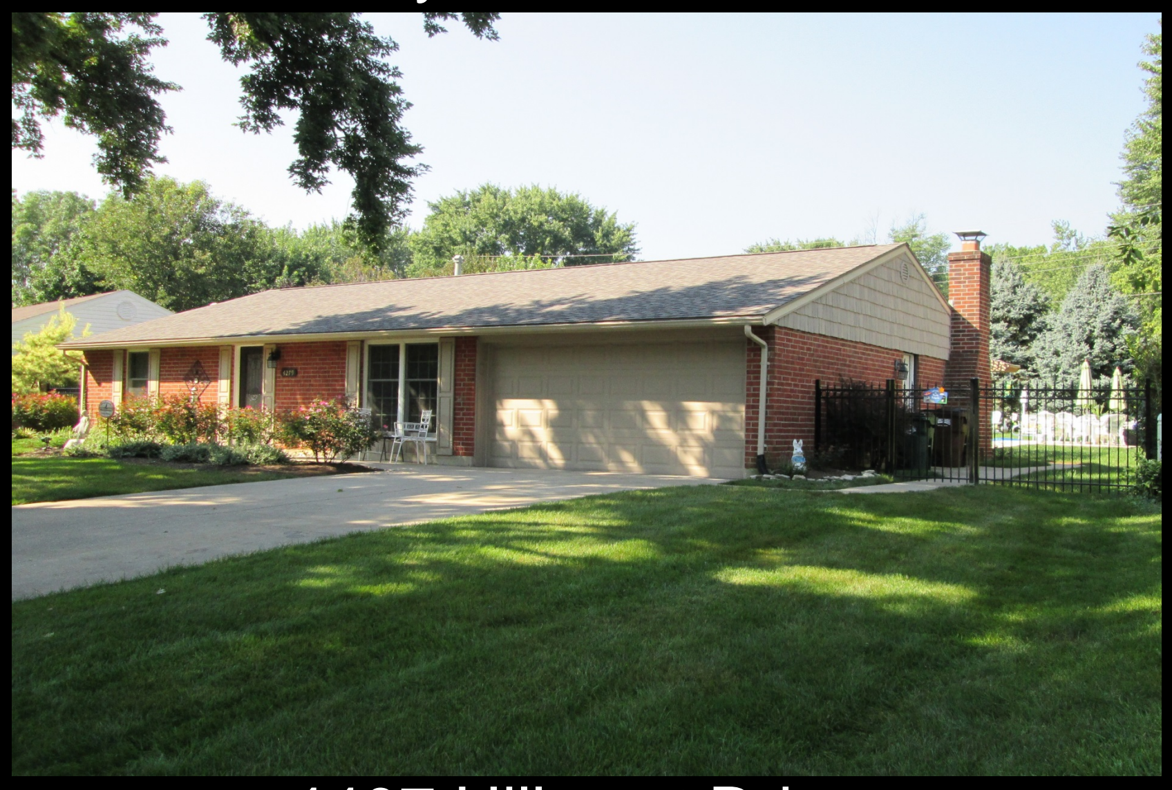
4407 Hillcrest Drive