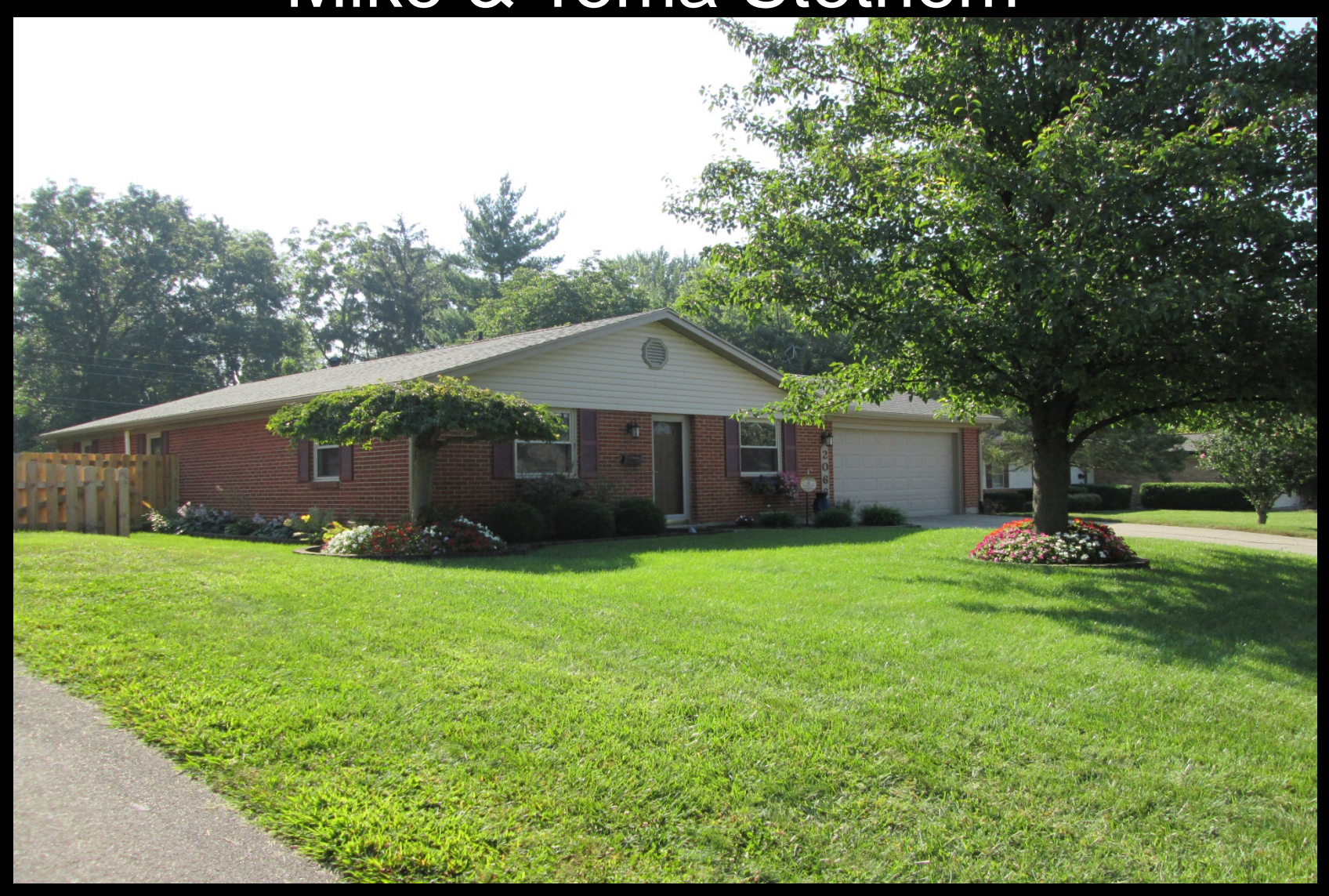
2066 Lakeman Drive