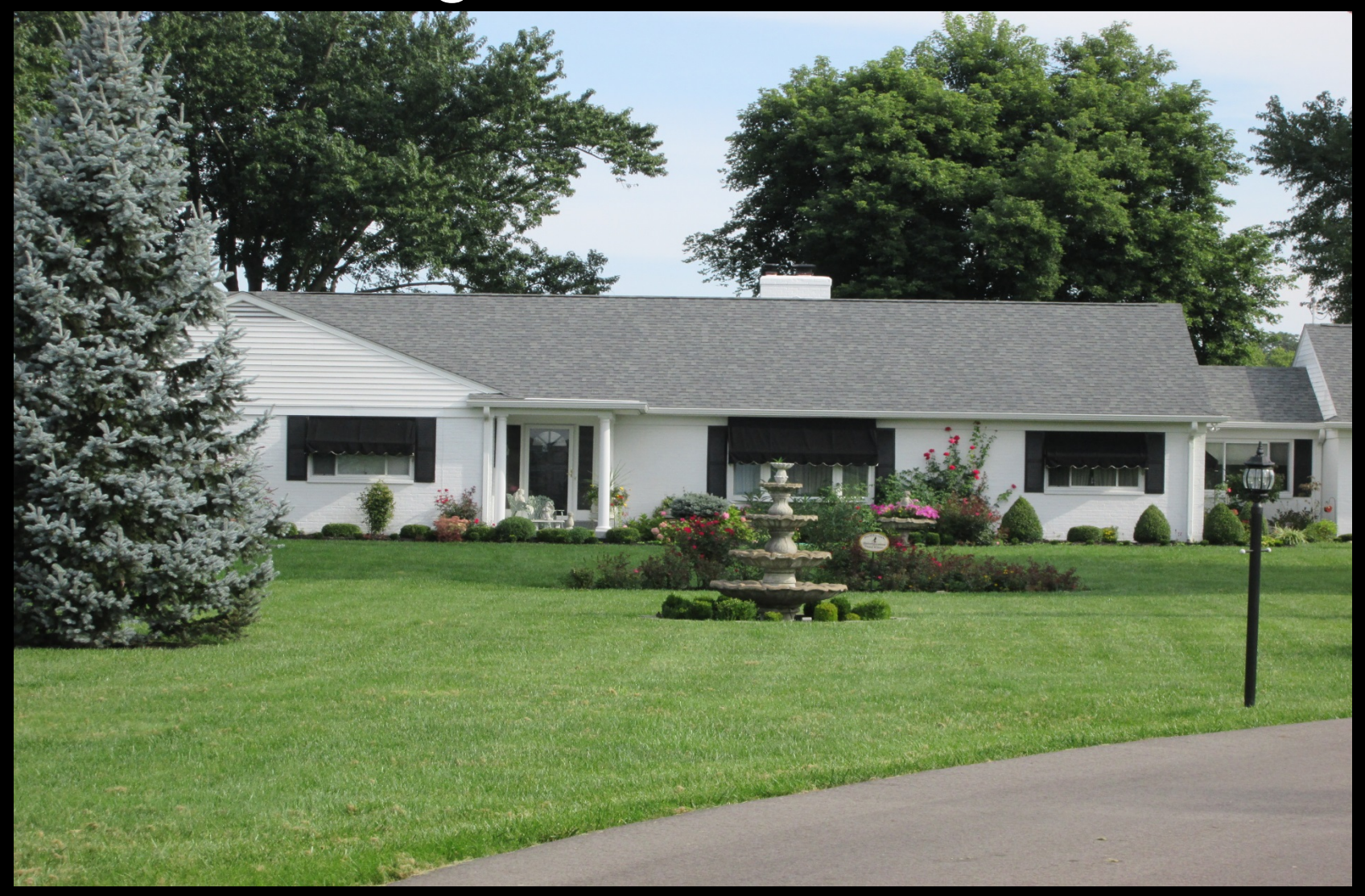
4008 West Franklin Street