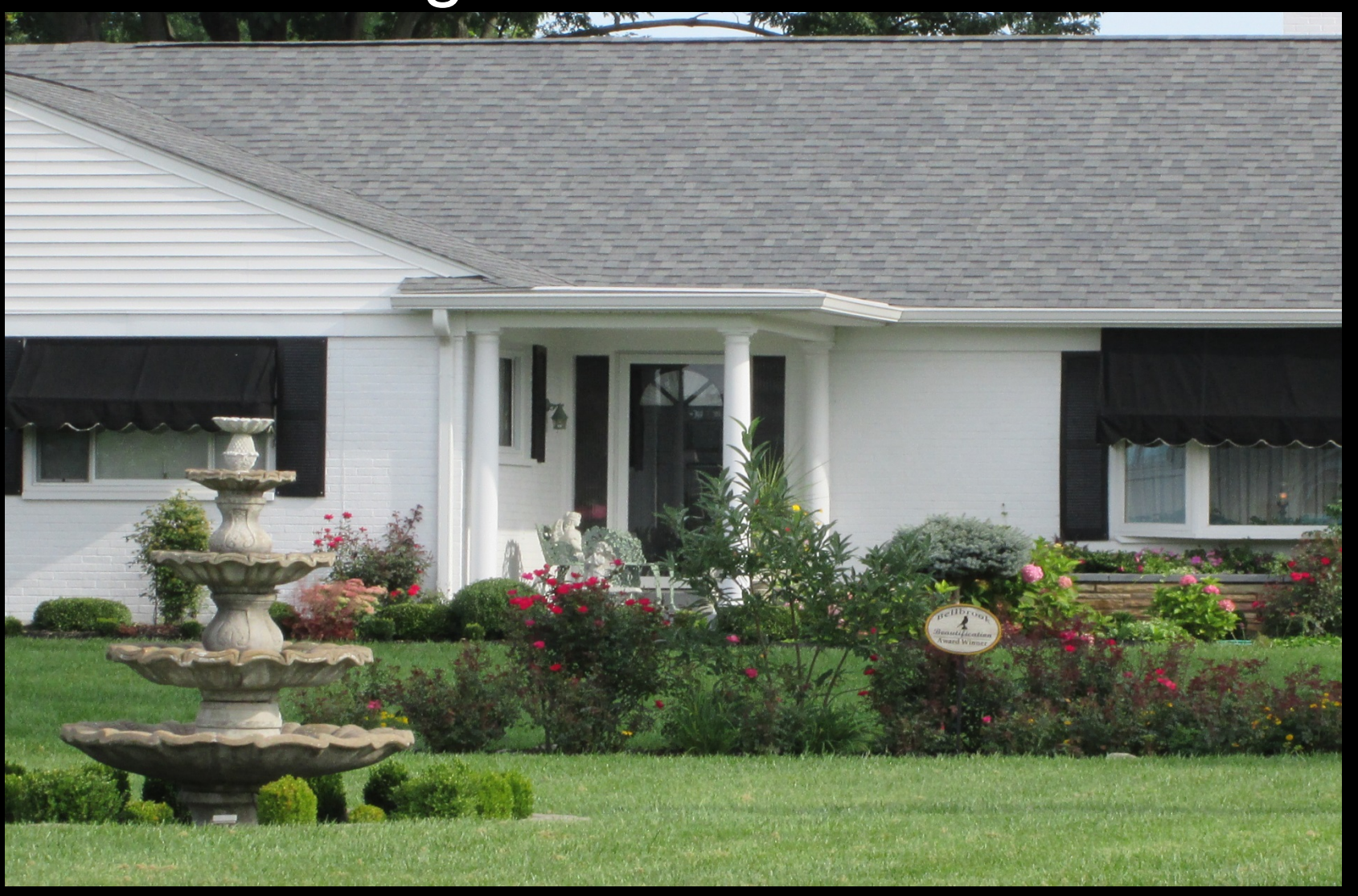
4008 West Franklin Street