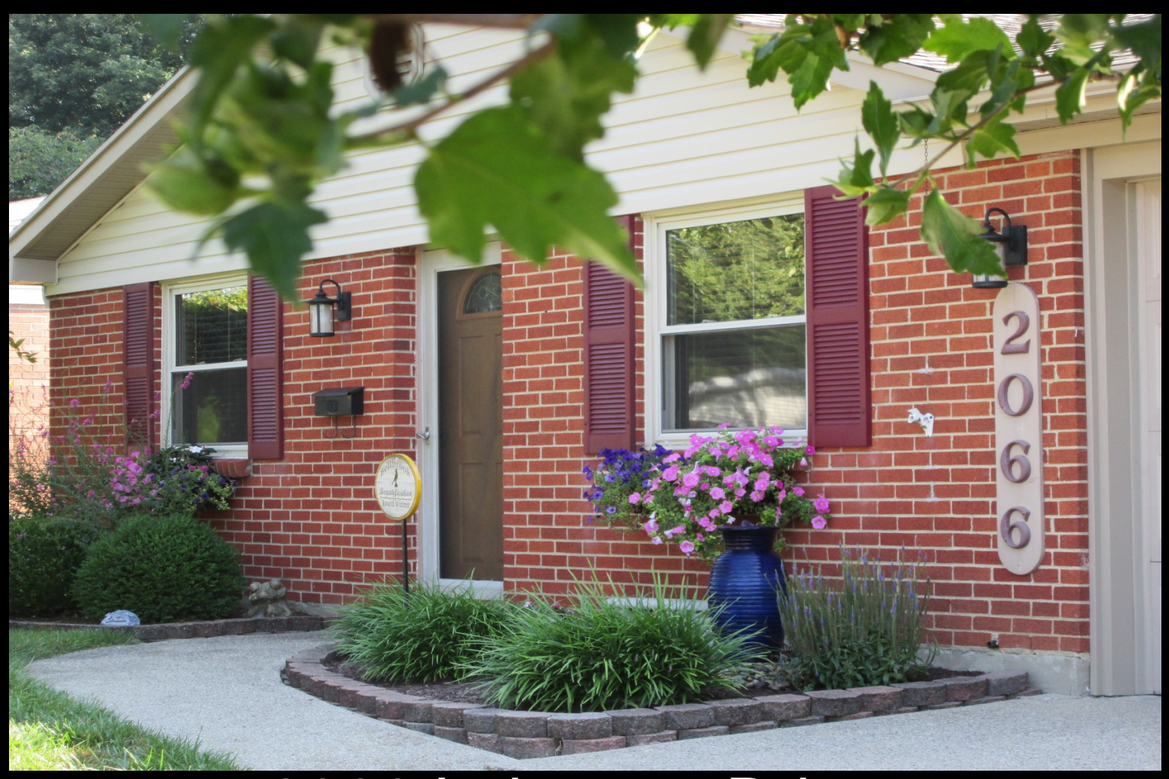
2066 Lakeman Drive