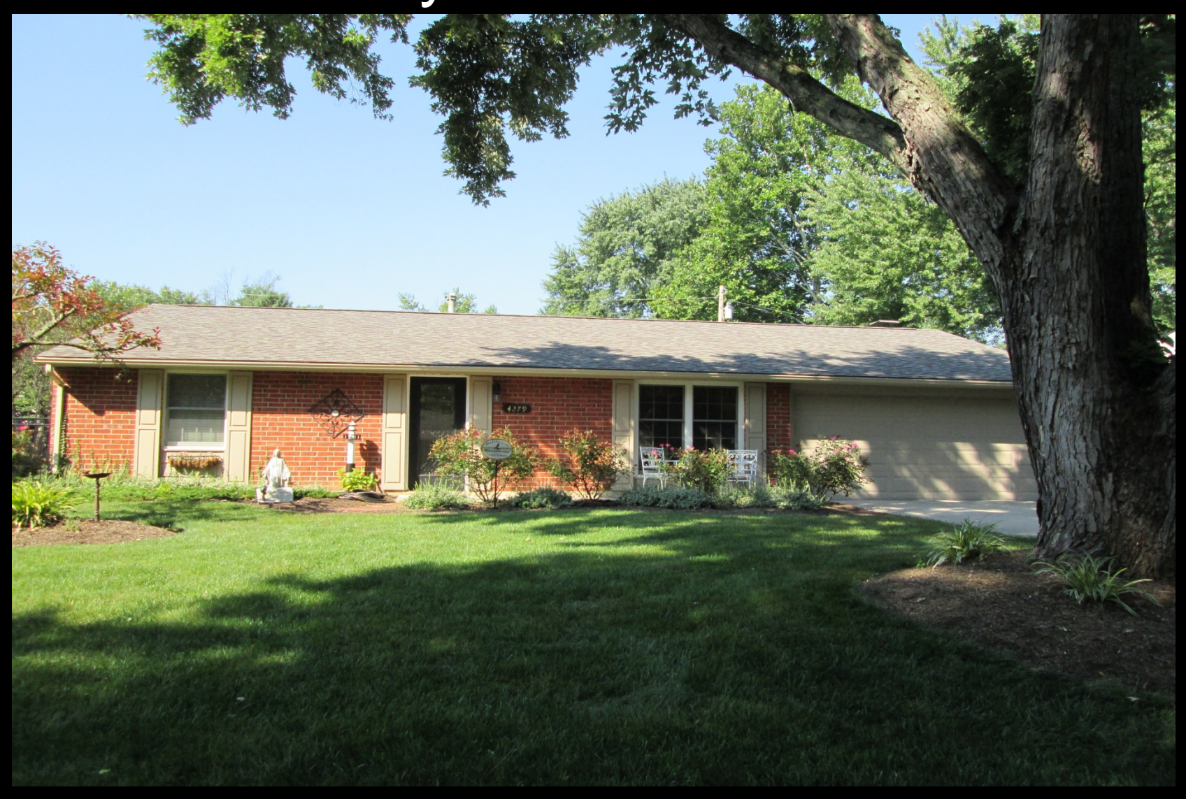
4279 Bellemead Drive