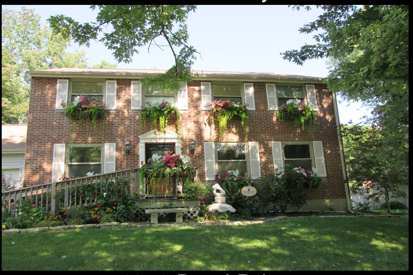
4278 Beryl Drive