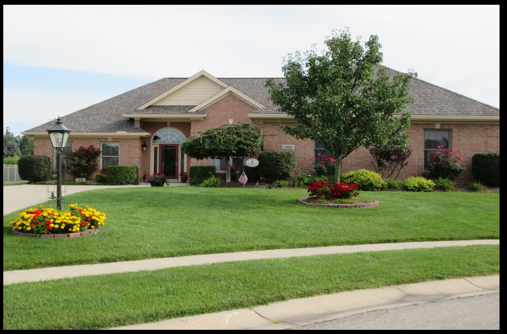
3948 Carmela Court East