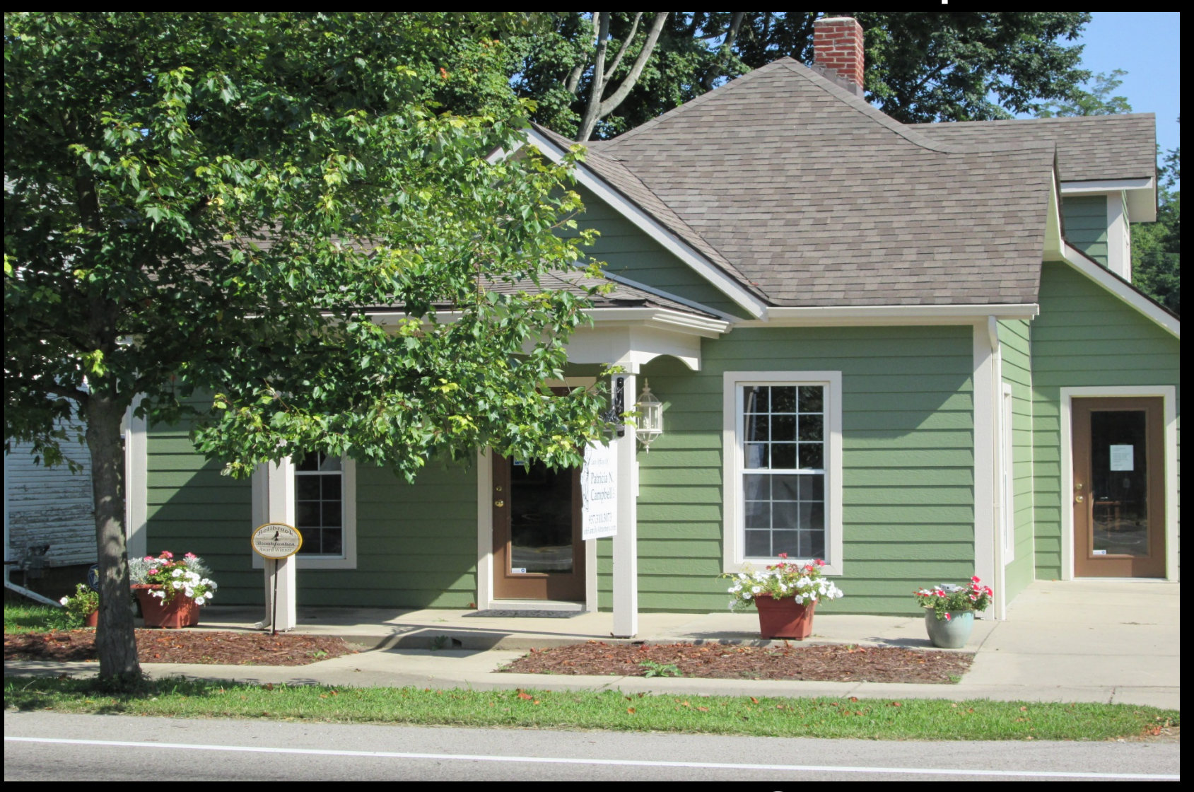
90 East Franklin Street