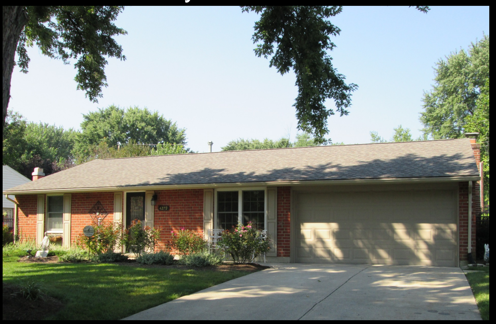
4279 Bellemeade Drive