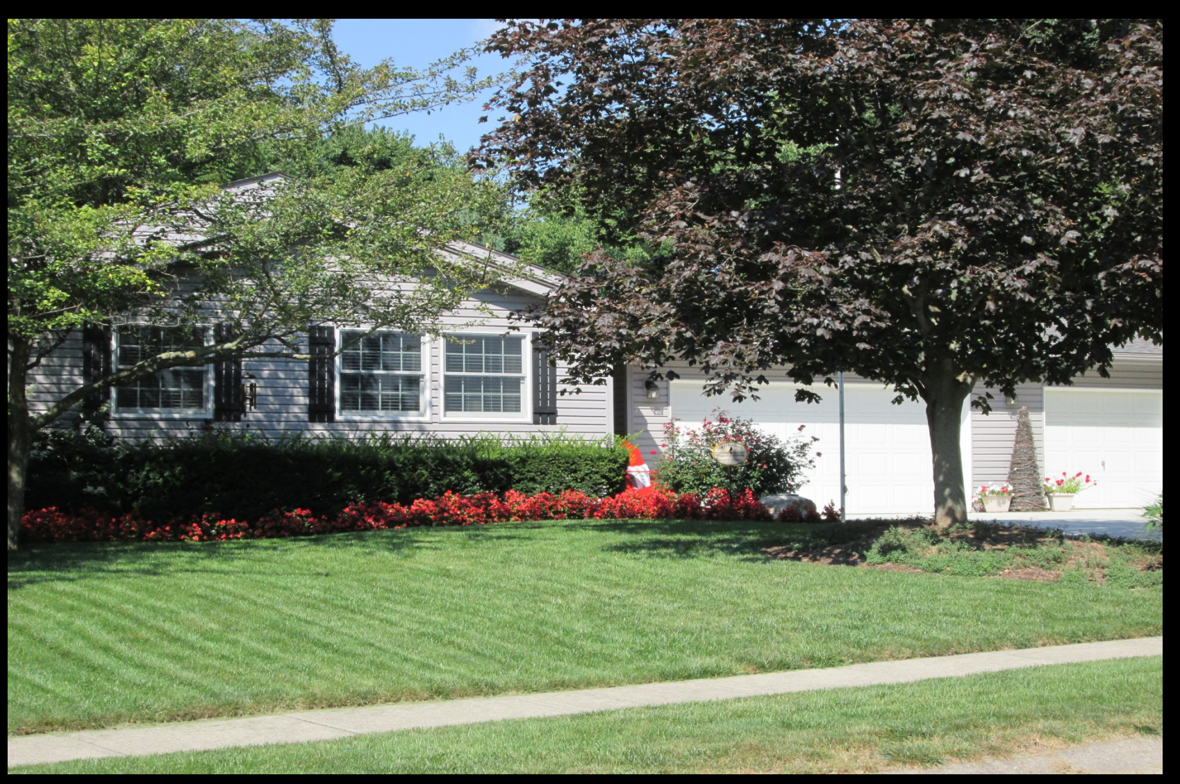
1519 Justin Court