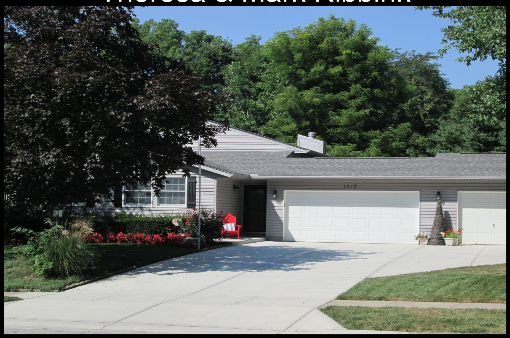
1519 Justin Court