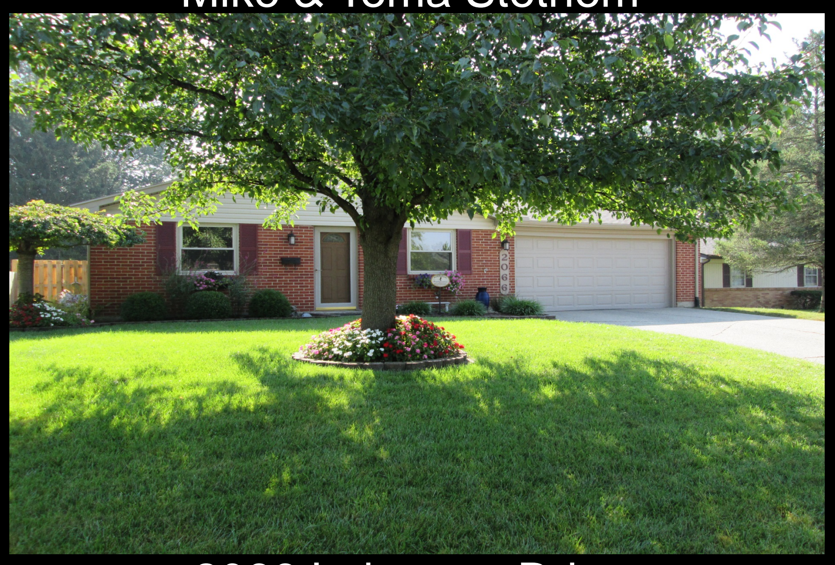
2066 Lakeman Drive