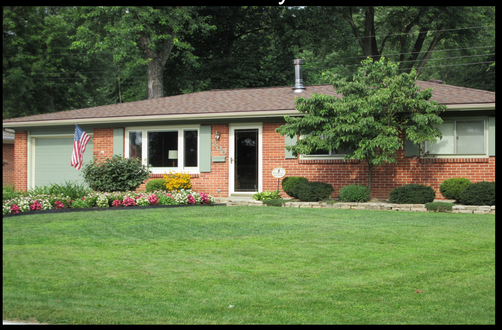
200 Washington Mill Road