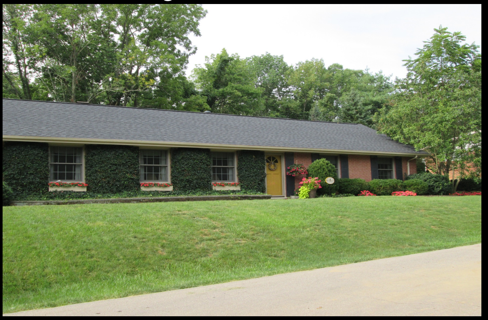
2471 Firefly Drive