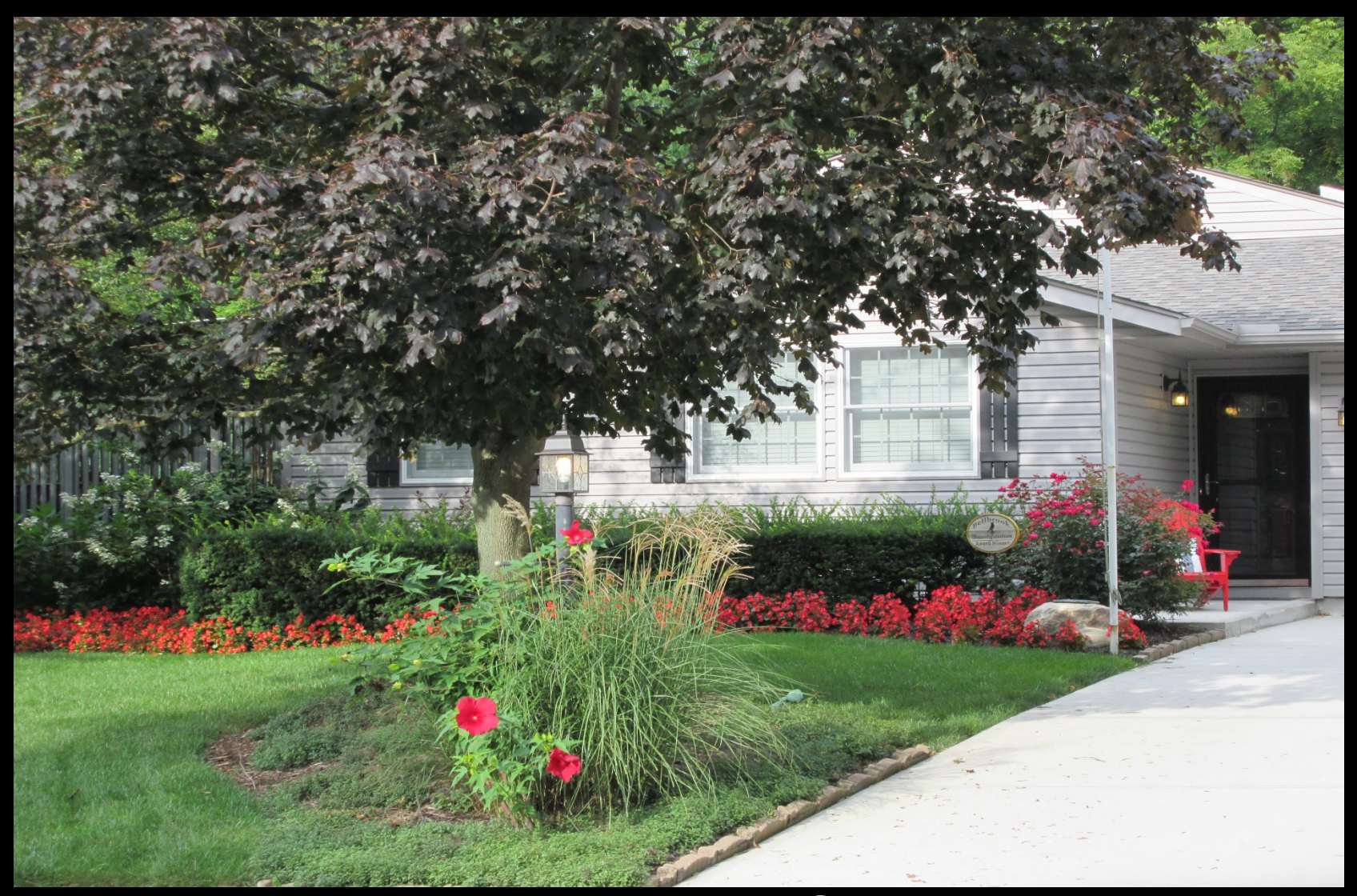
1519 Justin Court