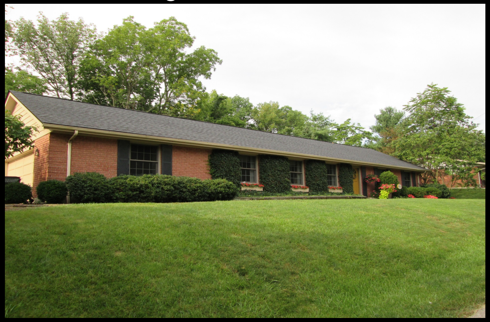
2471 Firefly Drive