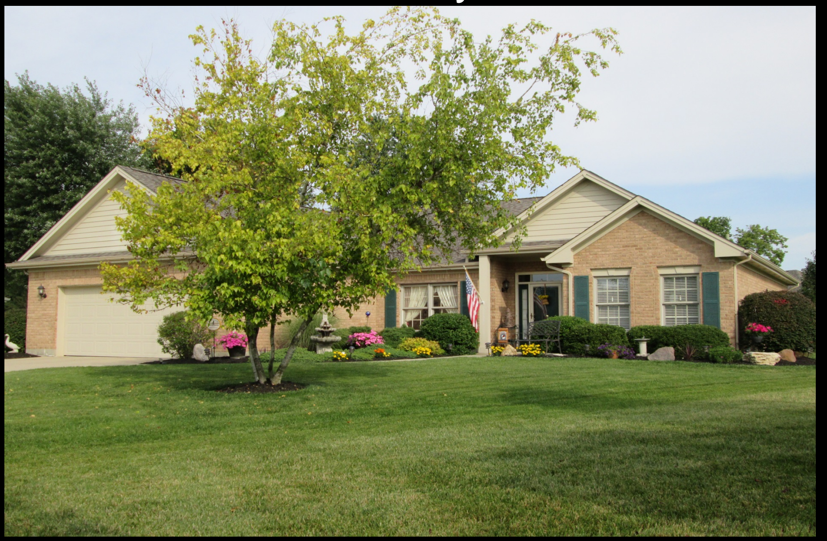
3986 Carmela Court West