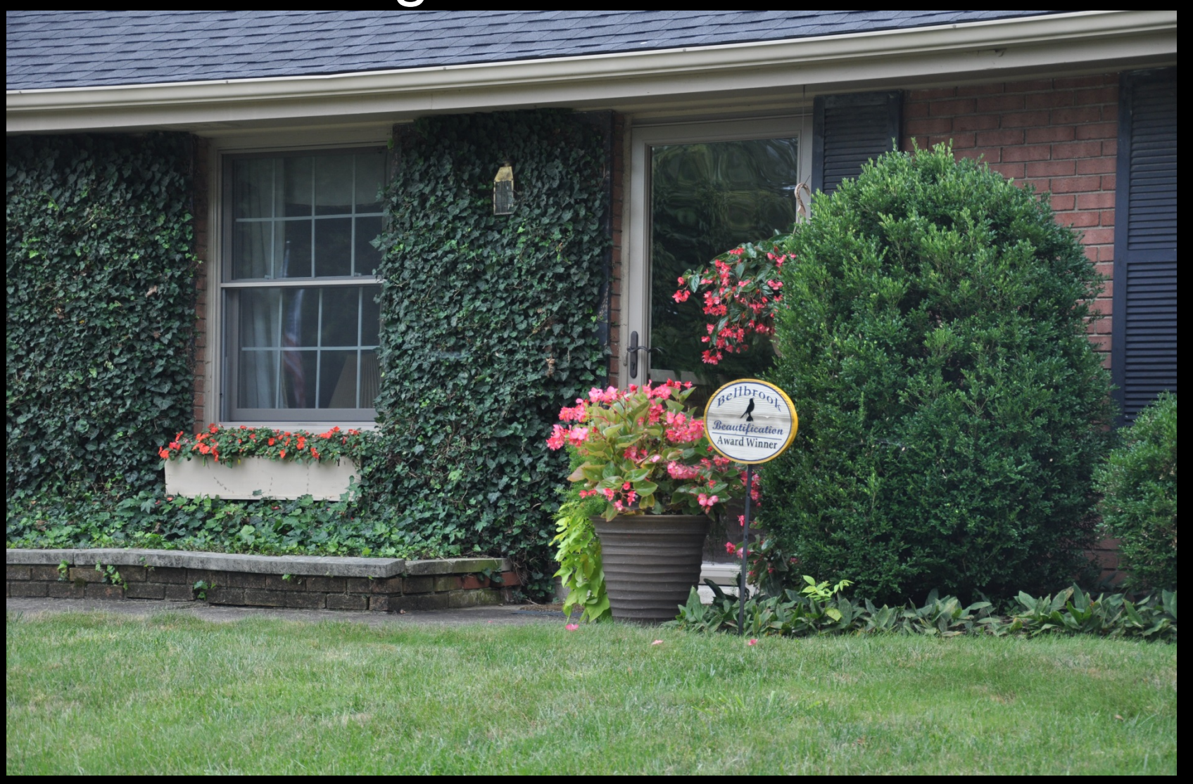
2471 Firefly Drive