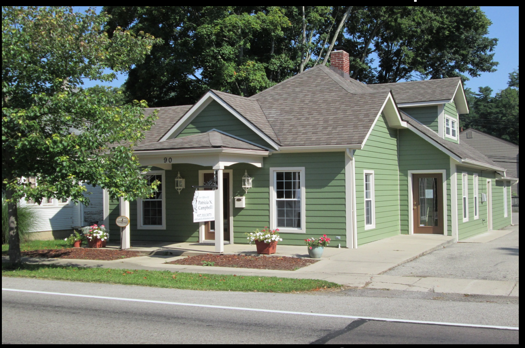
90 East Franklin Street