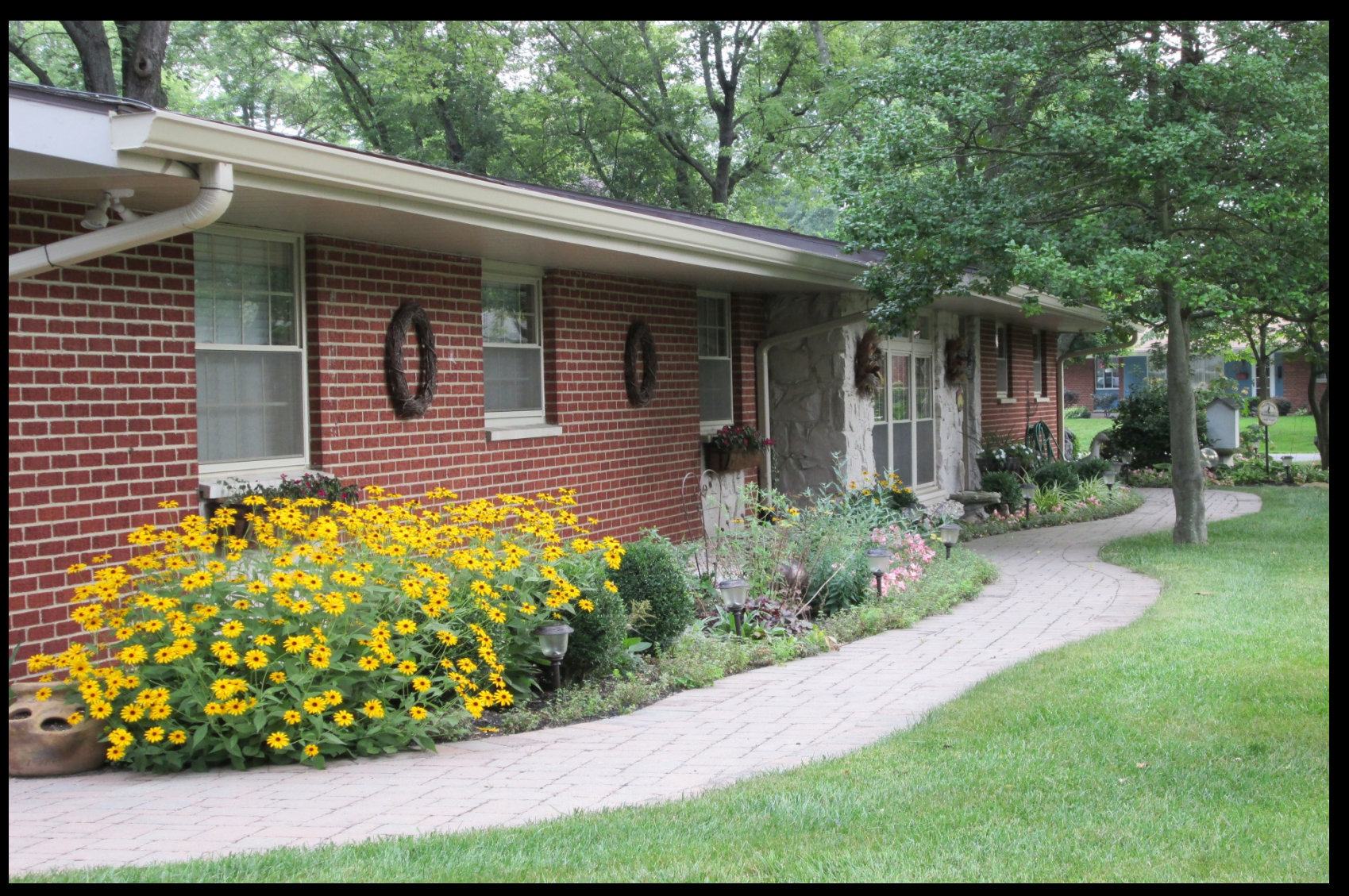
2383 Barnett Drive