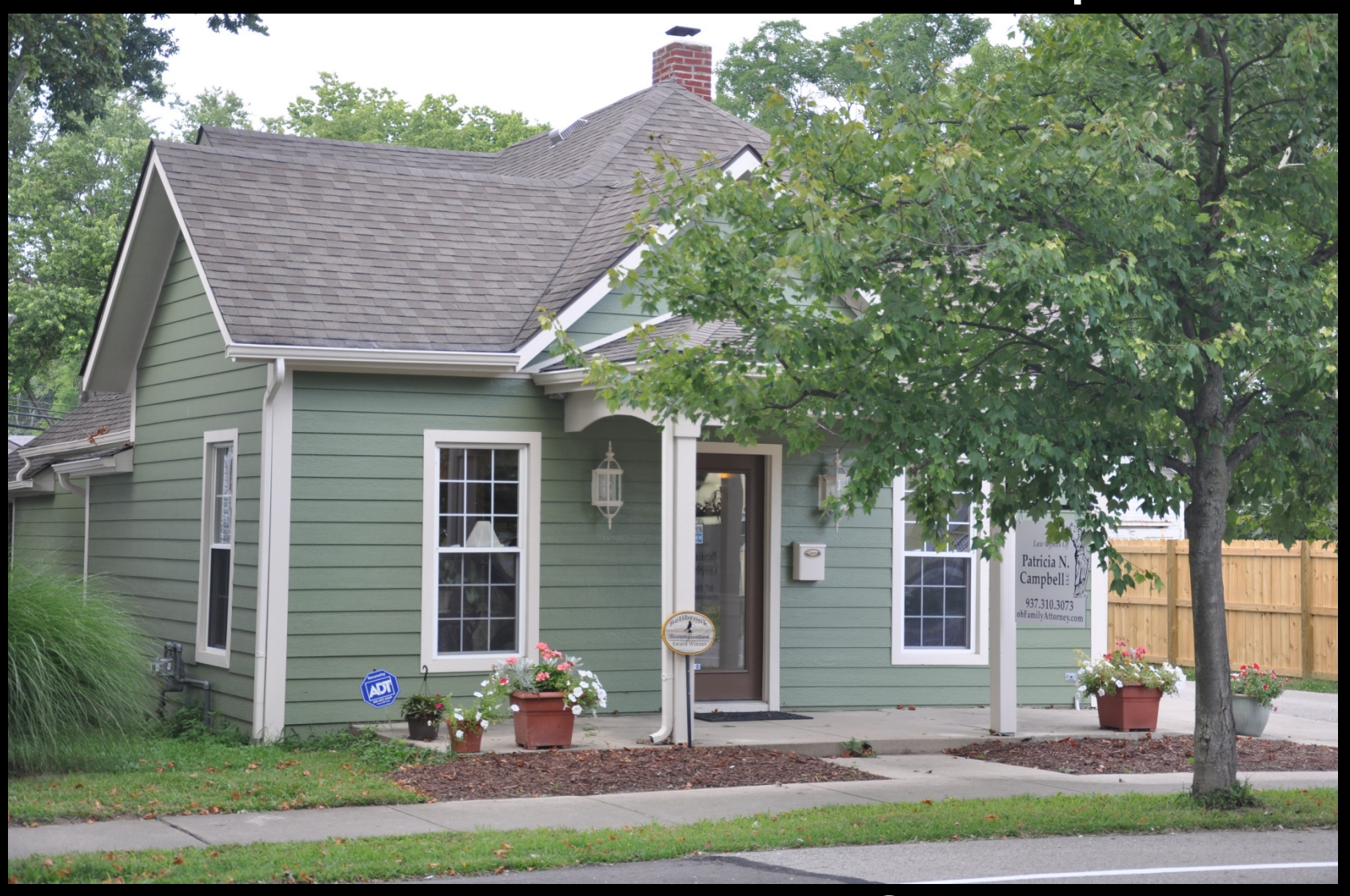
90 East Franklin Street