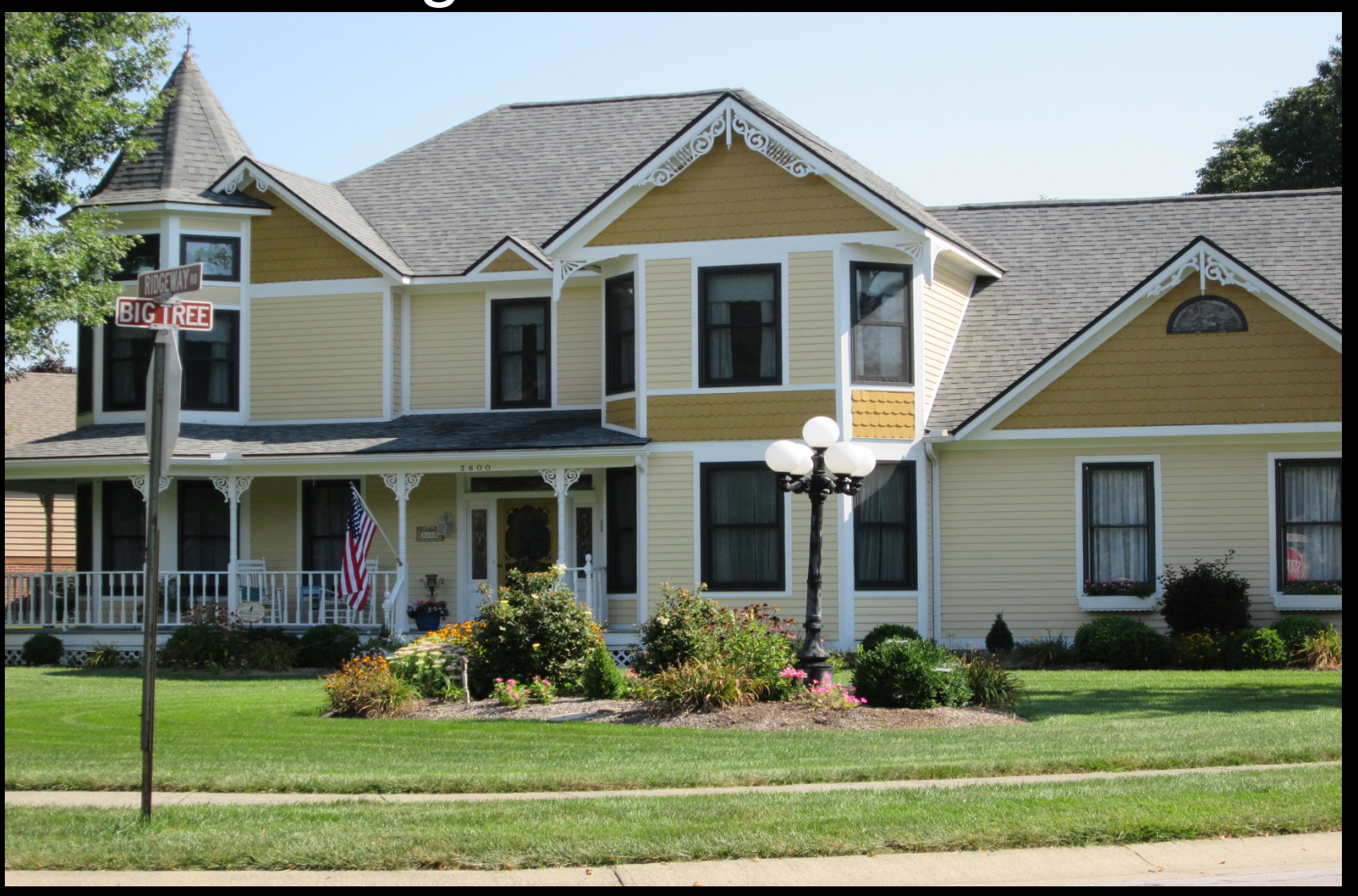
3600 Big Tree Road