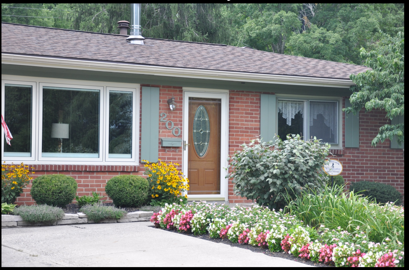
200 Washington Mill Road