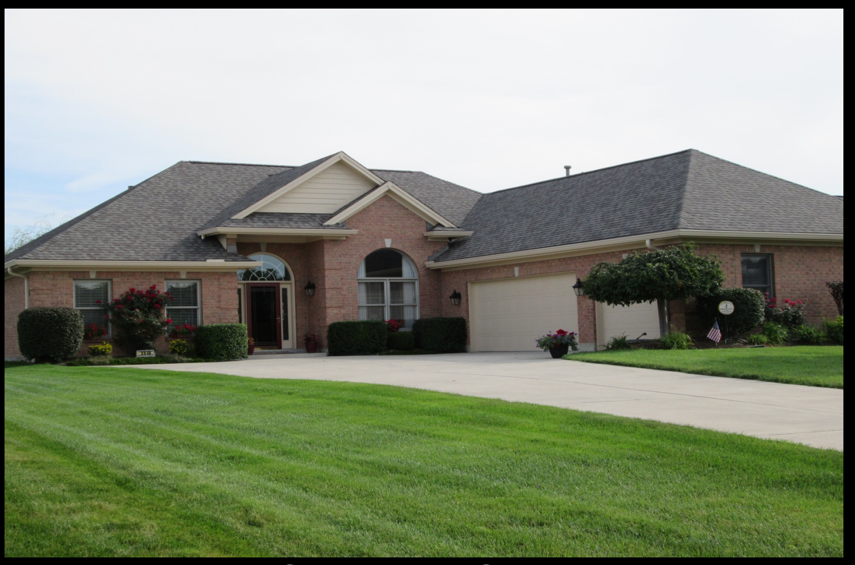
3948 Carmela Court East