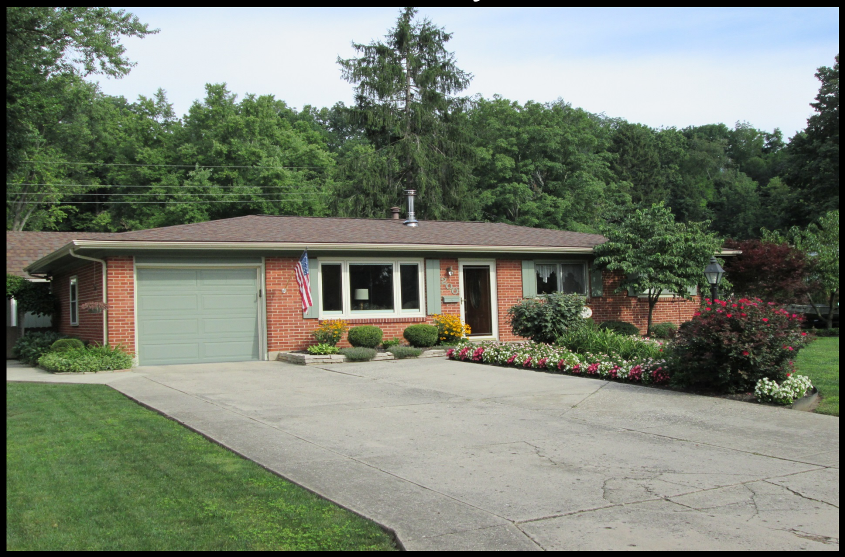
200 Washington Mill Road