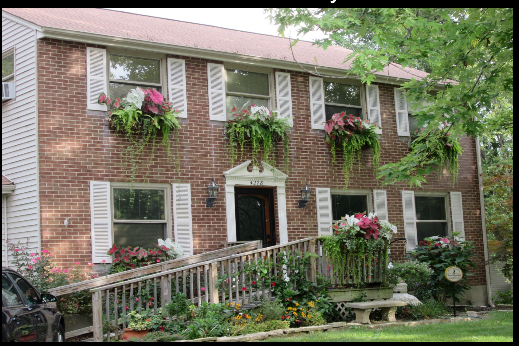
4278 Beryl Drive