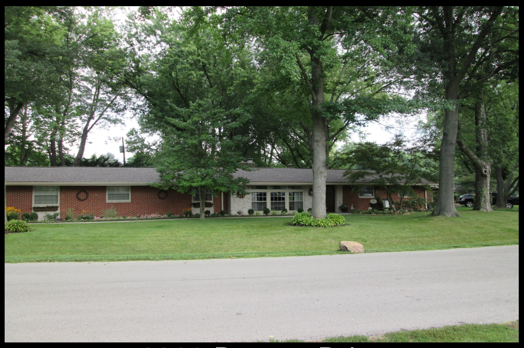
2383 Barnett Drive