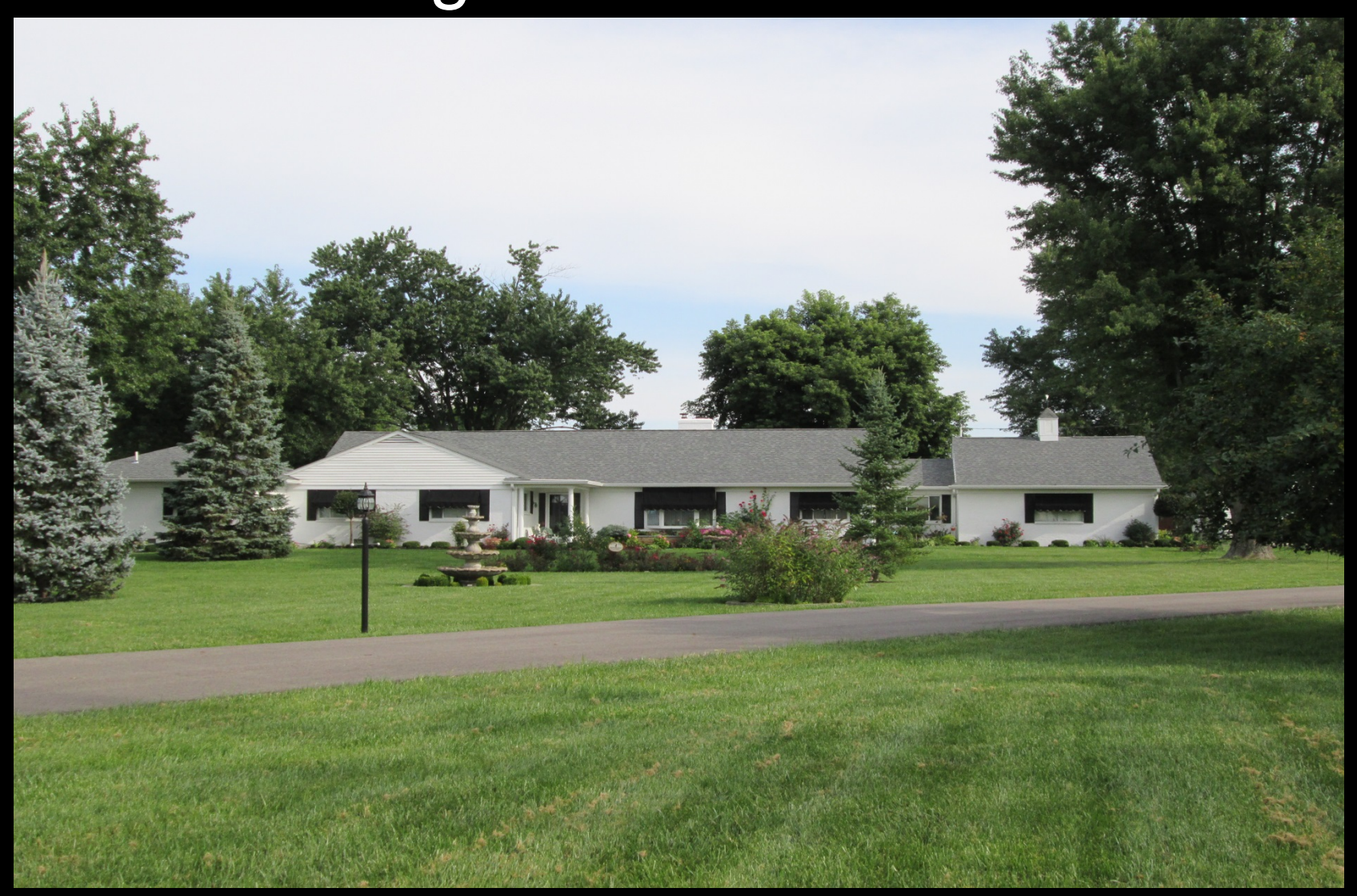
4008 West Franklin Street