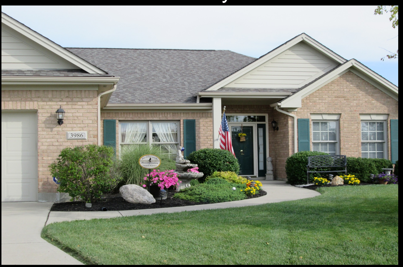
3986 Carmela Court West