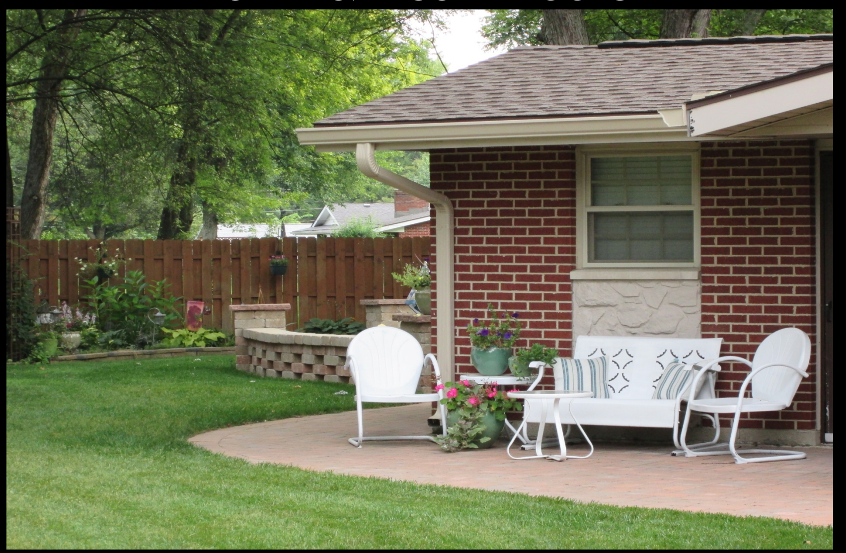
2383 Barnett Drive