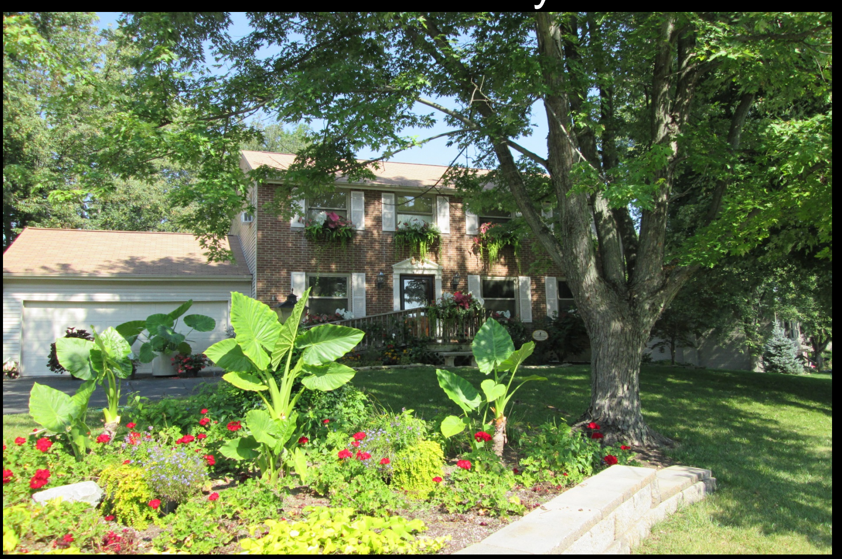
4278 Beryl Drive