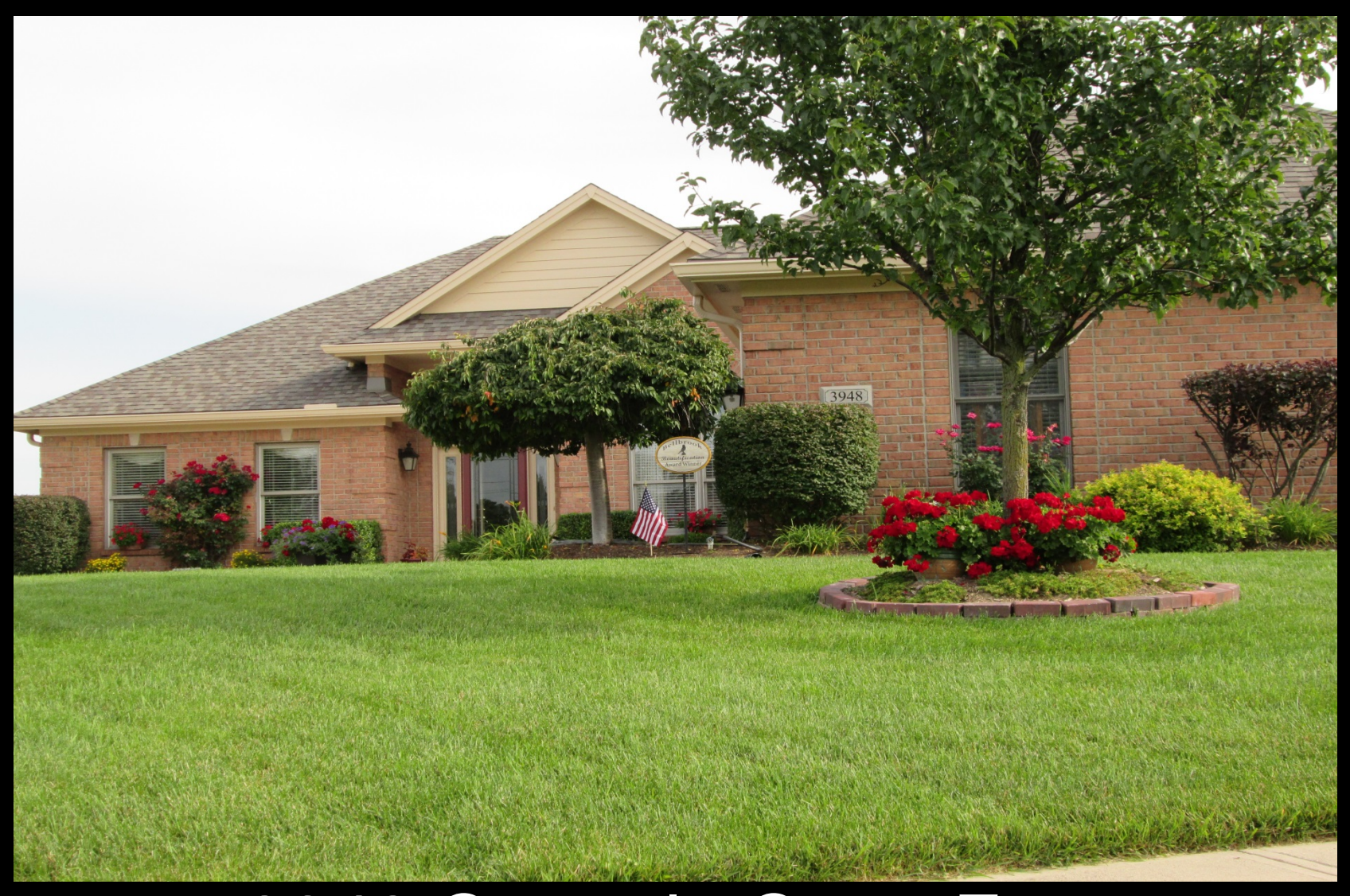
3948 Carmela Court East