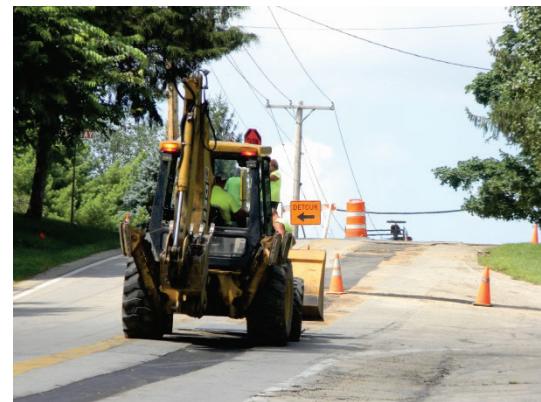
Pictured below: nearing completion of the new water line on North Main Street.