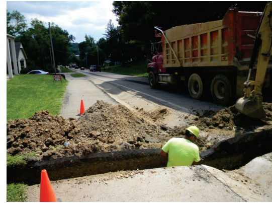
Pictured above: installation of a new fire hydrant on North Main Street.

There is currently a federally mandated street sign replacement program. The Service Department has been actively working on this program for some time. This summer, you will see crews stopping at all signs and collecting information. This program will be completed in 2015. You can call (937) 848-8415 for additional information.