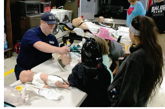
Pictured above: Fire Department Open House on October 10

Drive Thru Child Safety Seat Inspection The Bellbrook Fire Department hosted its 7 th annual “Drive Thru Child Passenger Safety Seat Inspection” event on October 1. This event allows parents, grandparents, and caretakers to have their child’s safety seat inspected and installed by a certified Passenger Safety Seat Technician. It is estimated that close to three out of four parents do not properly use child restraints. For this reason, the event stresses the importance of having a child safety seat installed properly. If you were unable to attend this event and would still like assistance installing your child’s safety seat, you may contact the Fire Department at (937) 848-3272 to schedule an appointment.