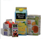
Food and Beverage Cartons empty and replace cap