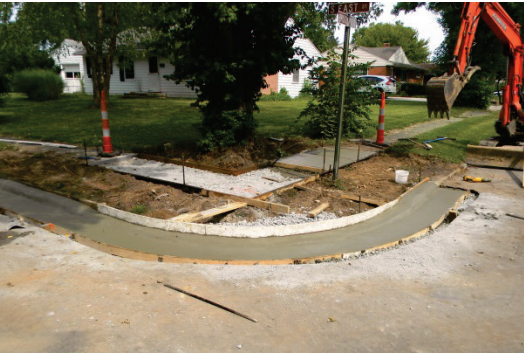
Pictured above: replacement of a ramp at South East Street and Brookwood Drive