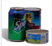
Aluminum and Steel Cans empty and rinse