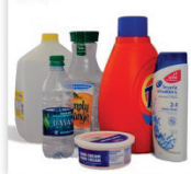
Kitchen, Laundry, Bath: Bottles and Containers empty and replace cap