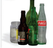
Bottles and Jars empty and rinse