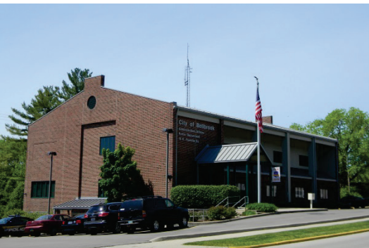
Pictured above: City Administration and Police Department building downtown

The Bellbrook Police Department wishes you safe travels!