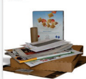
Mixed Paper, Newspaper, Magazines, and Flattened Cardboard