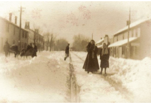
Pictured above: Snow in downtown Bellbrook - date unknown