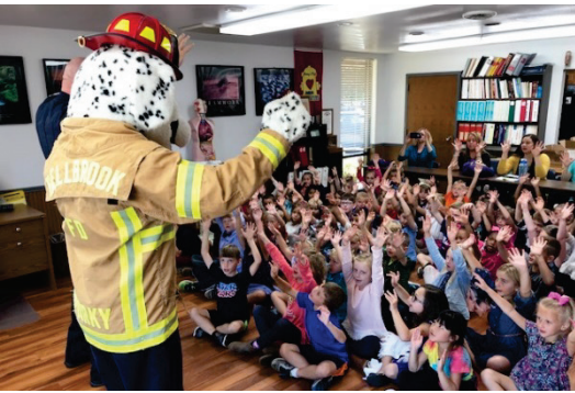
Pictured above: Students attending Fire Prevention Week

Open House On October 10, the Bellbrook Fire Department hosted its annual Open House. Each year, it is our privilege to open our doors to the public and allow them a closer look at the services we provide each and every day. We were pleased again with such a great turnout from the community with over 1,500 in attendance. With displays and demonstrations ranging from vehicle extrication to the LUCAS CPR machines, there is something for everyone to see. The Fire Prevention Week theme this year was, “Every Second Counts, Plan Two Ways Out!” in reference to planning emergency escape routes. If you have any questions regarding anything you saw during the Open House, please give us a call at (937) 848-3272 and we will be happy to help.