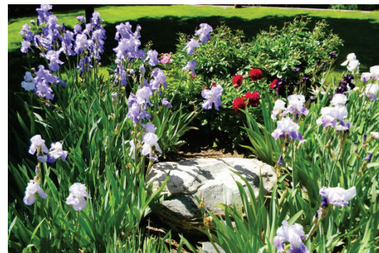
Pictured above: Irises at the Museum

As this column is being written, spring has shown changes to the gardens and the inside of the Museum is showing the results of several months of intense work on the exhibit space and infrastructure. The Parlor Entrance is benefiting from new window sashes paid for by the recent fundraising project. New period-correct paint has been applied on the floors to reflect the deeper colors used at the turn of the 20 th century as an aid to disguise dirt before the general use of vacuum cleaners. Unseen, but structurally critical, are the new support floor joists and foundation supports that underpin the nearly 200 year old log building. In the Artifact Room, the walls have been painted and period appropriate trim has been added to better present the revamped collection of Bellbrook artifacts. The Kitchen collection has also been refreshed with new paint. Work continues in the Rotating Exhibit Room as the city continues the stabilization of the log frame structure with new and reinforced floor joists, new flooring, and update the trim to reflect the age of the building. Spring always brings new and exciting things as we present interesting and informative exhibits for your discovery. We invite you and your entire family to join us soon for a change from the daily grind, to pause and learn about your community's rich history. Visit the Bellbrook Historical Museum at 42 North Main Street on Wednesdays from 10 am to 2 pm and Saturdays from 12 pm to 4 pm.