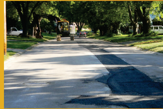
Pictured below: current Street and Water projects

For more information on Property Maintenance and Zoning Code enforcement, you can visit our website at www.cityofbellbrook.org . Property maintenance complaints can be submitted online. You can also call the Administration office at (937) 848-4666.