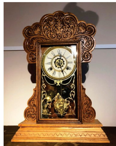
Pictured above: mantle clock currently on display