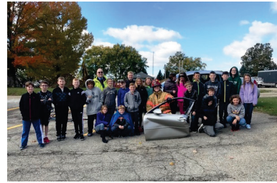
Pictured above: Fifth Grade Class Visit at Fire Station 2