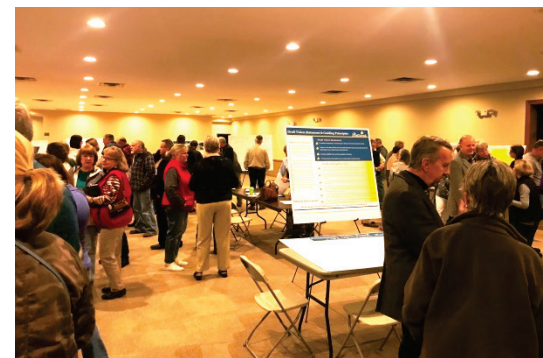
Pictured above: Community Visioning Meeting on November 5

The Comprehensive Plan is a document that describes the history, current condition, and future vision for the community. It serves as a guide for future growth and development while promoting the health, safety and general welfare of the people. Even though Bellbrook is mostly built-out, there are still opportunity areas where city leaders want to know what the community thinks these areas should look like. As time goes on, the city will be faced with redevelopment and the plan will address this as well. The plan will also cover how we should approach transportation including paths and bike lanes. A major focus of discussion in the plan is how we should focus on downtown. The city wants to ensure our priorities match those of our citizens.