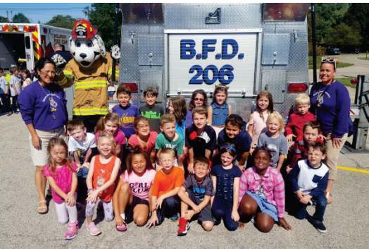
Pictured above: Students attending Fire Prevention Week in October