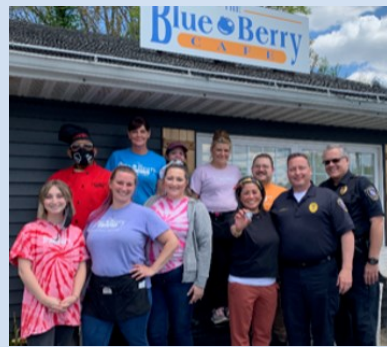
May 2021: Blue Berry Café