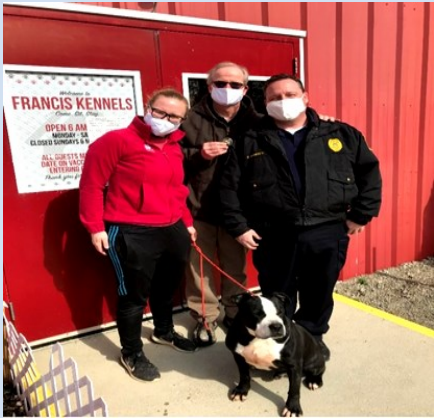
February 2021: Francis Kennels