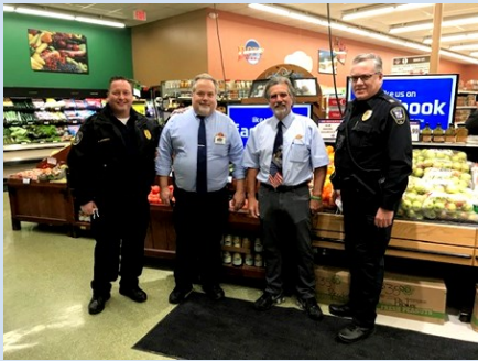
January 2021: Dot's Market