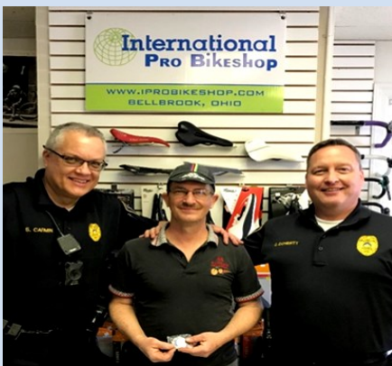
April 2021: International Pro Bike Shop