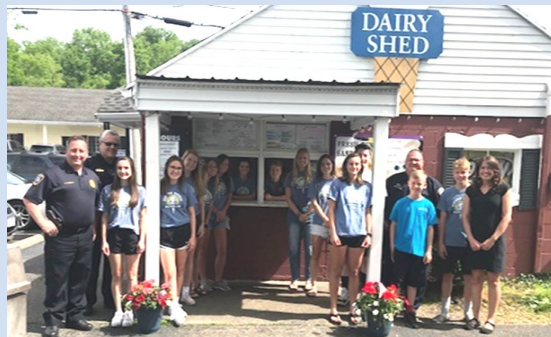
June 2021: Dairy Shed