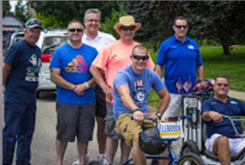
Big Wheel Race teams from Bellbrook/STPD