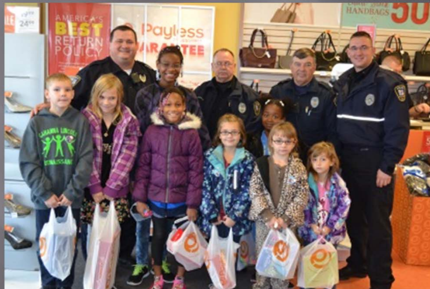
Officers participating in the annual FOP shoe program for children