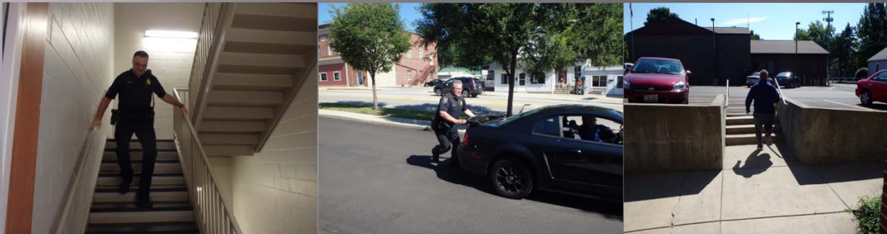
Officers completing an agility test