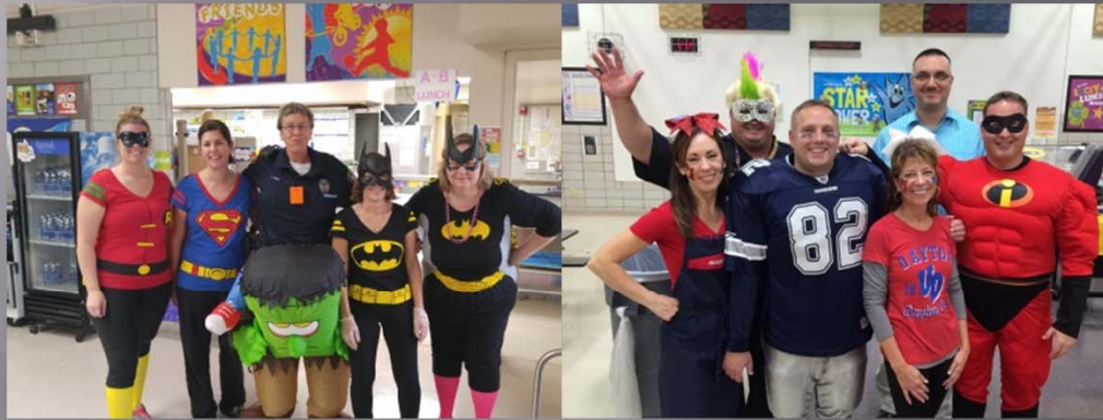
Officers dressing up for Halloween