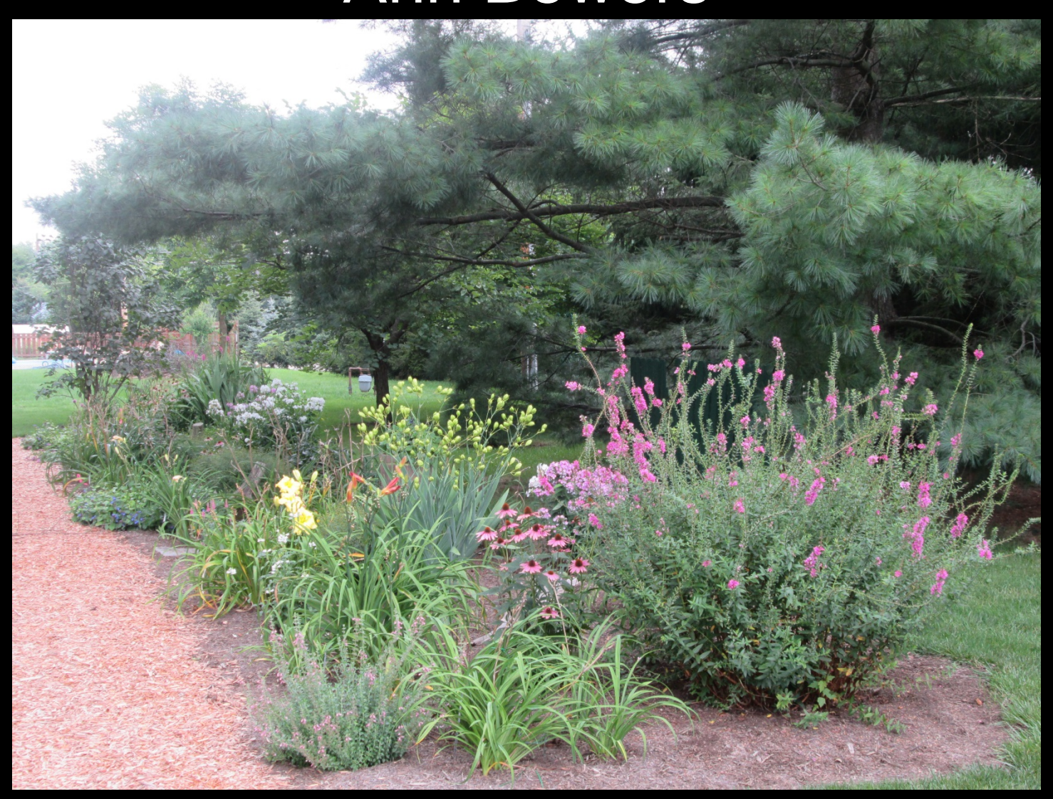
1860 North Belleview Drive