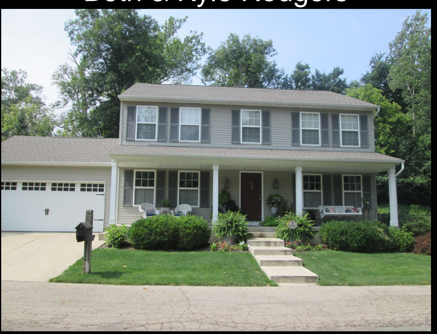
1195 Clearcreek Lane