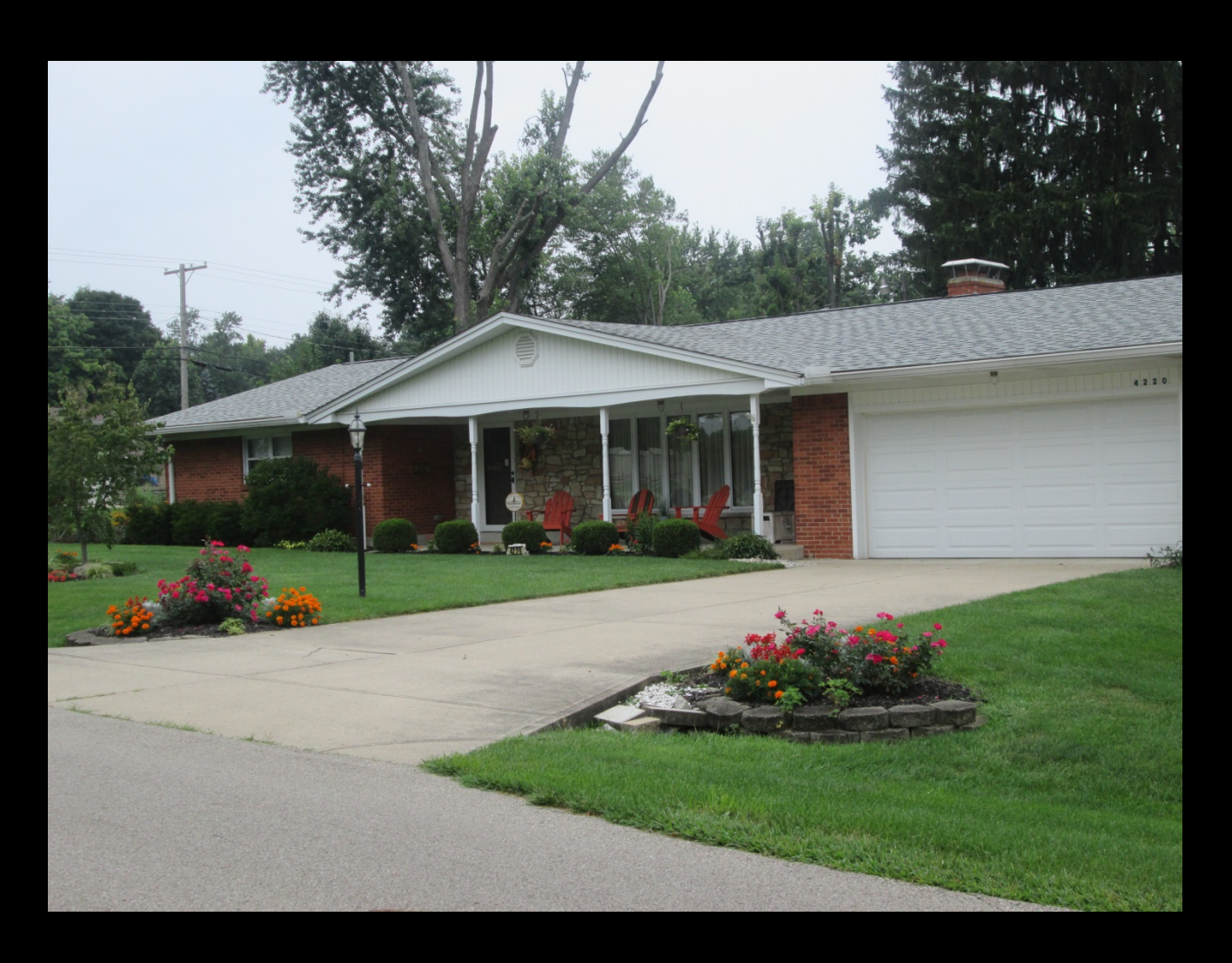
4220 Woodedge Drive