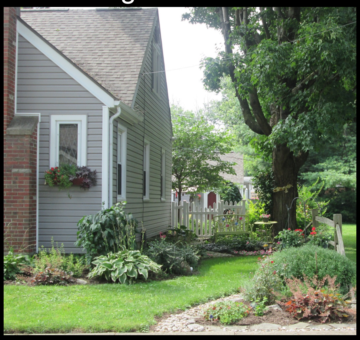
31 East Maple Street