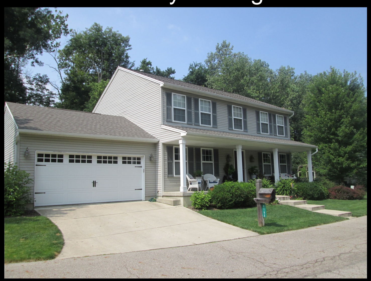
1195 Clearcreek Lane