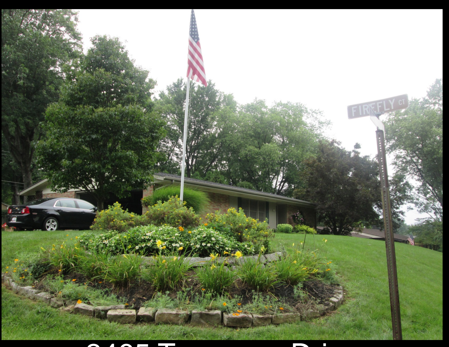
2465 Tennyson Drive