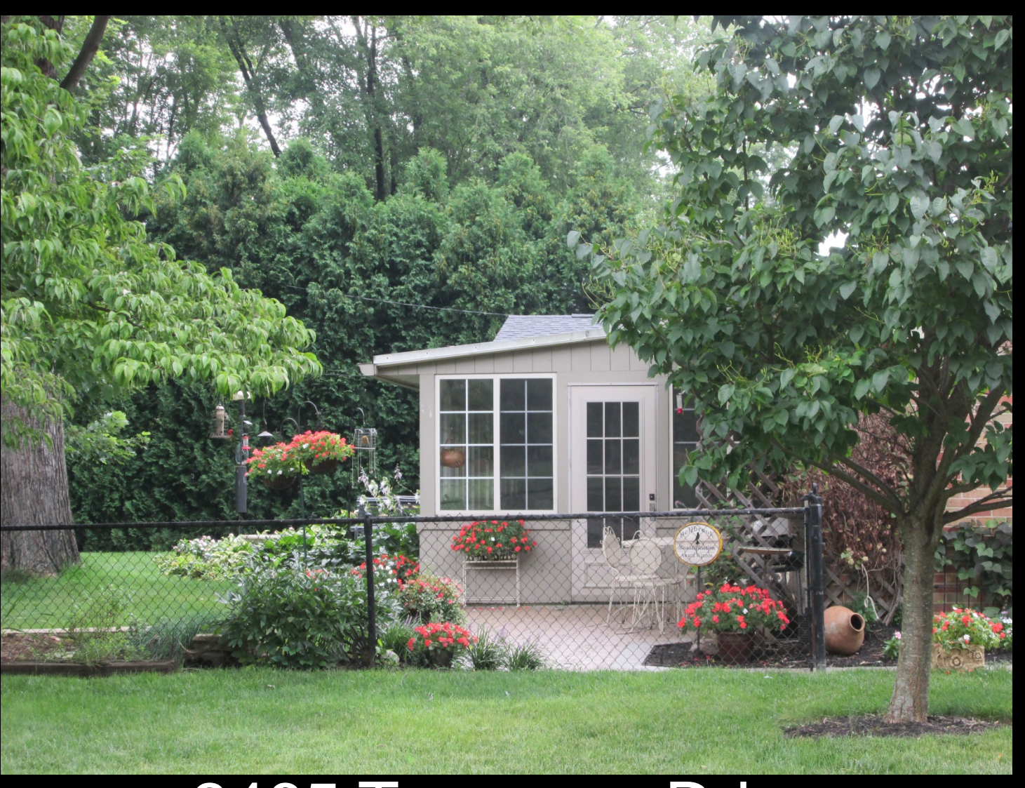
2465 Tennyson Drive