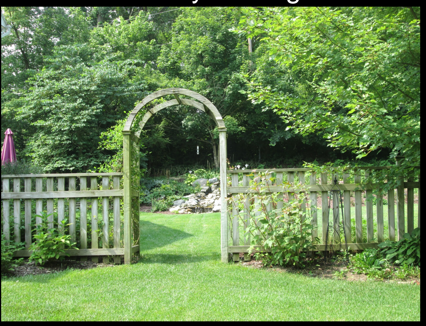
1195 Clearcreek Lane