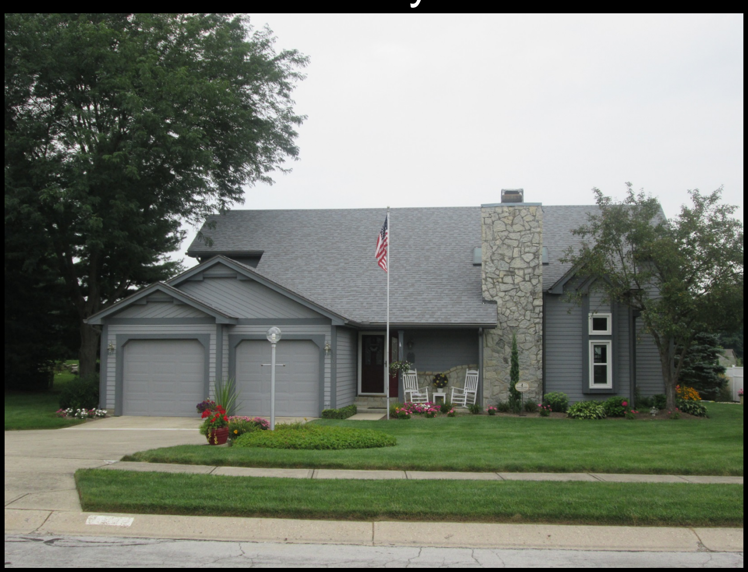
4108 N Linda Drive