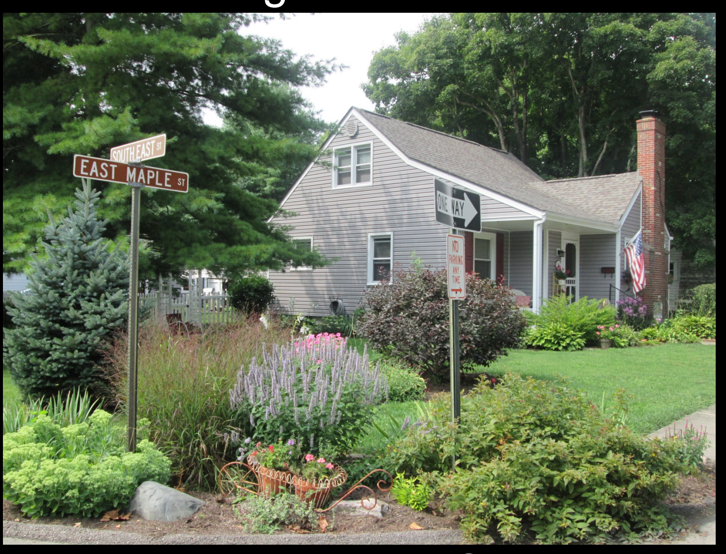
31 East Maple Street