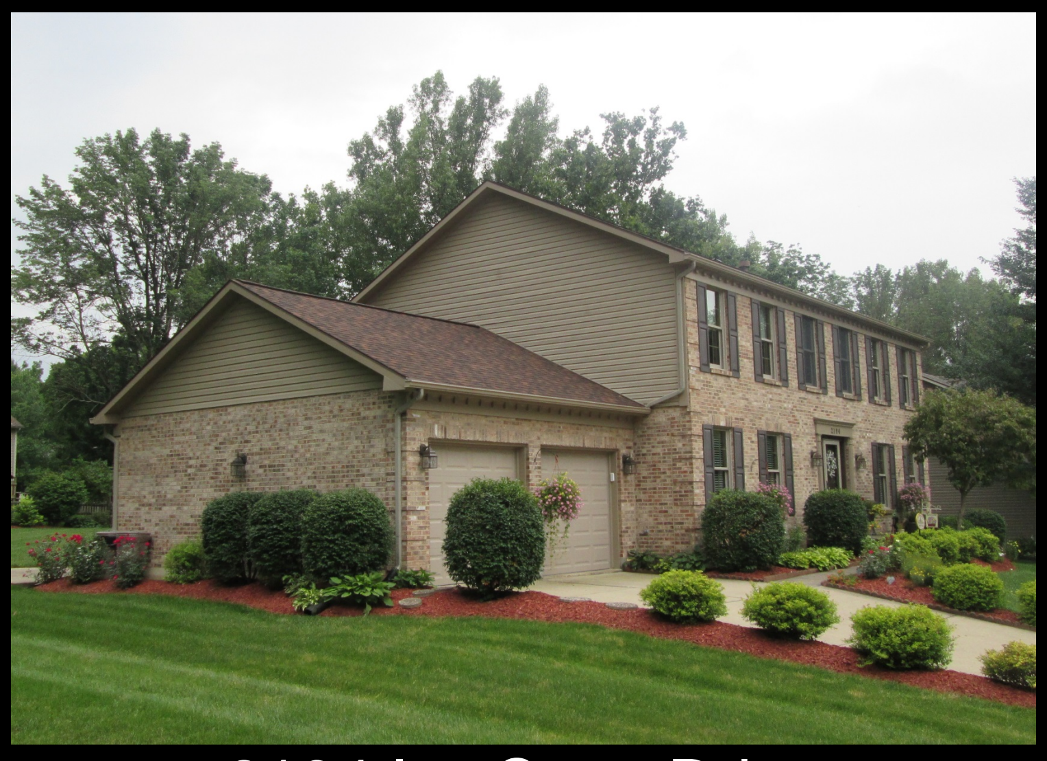
2194 Ivy Crest Drive