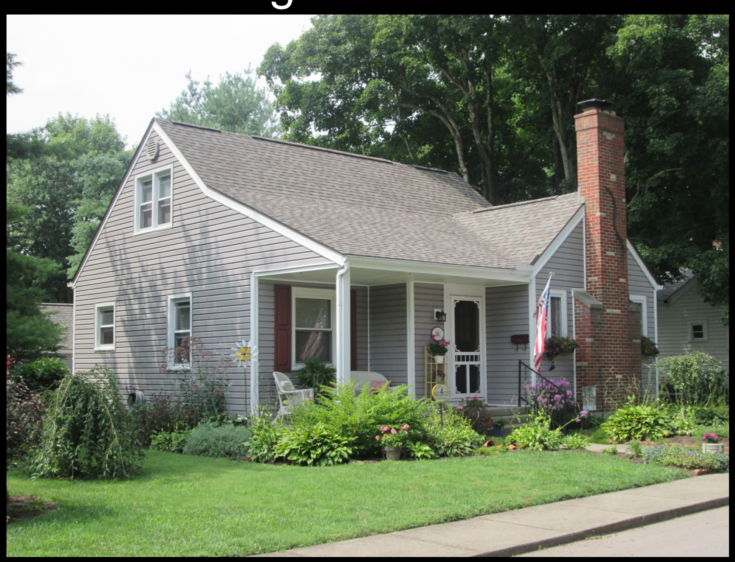
31 East Maple Street