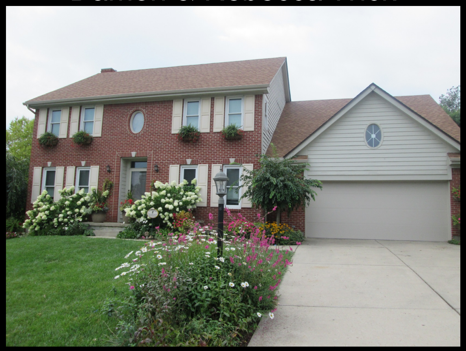
3857 West Sudbury Court