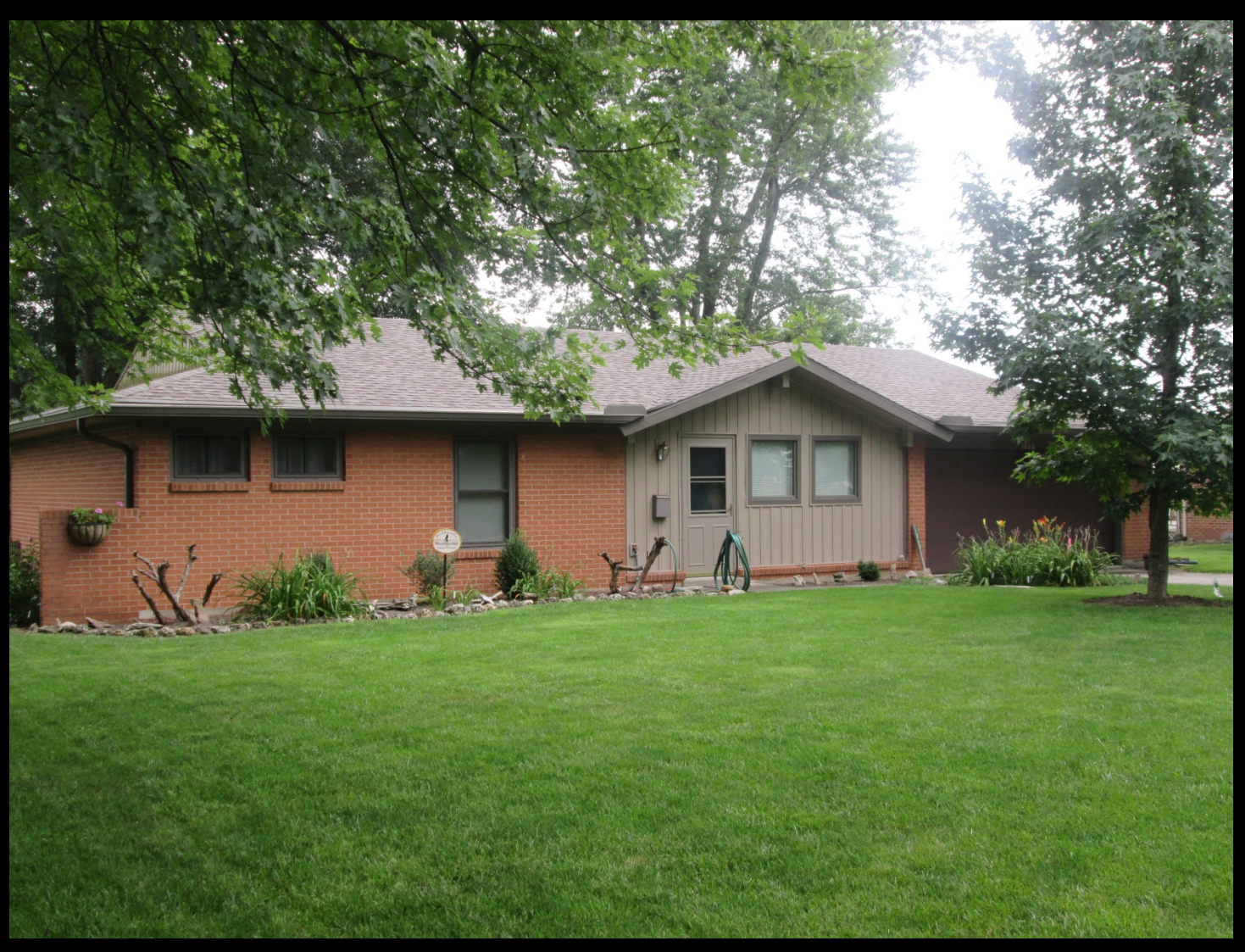
1860 North Belleview Drive