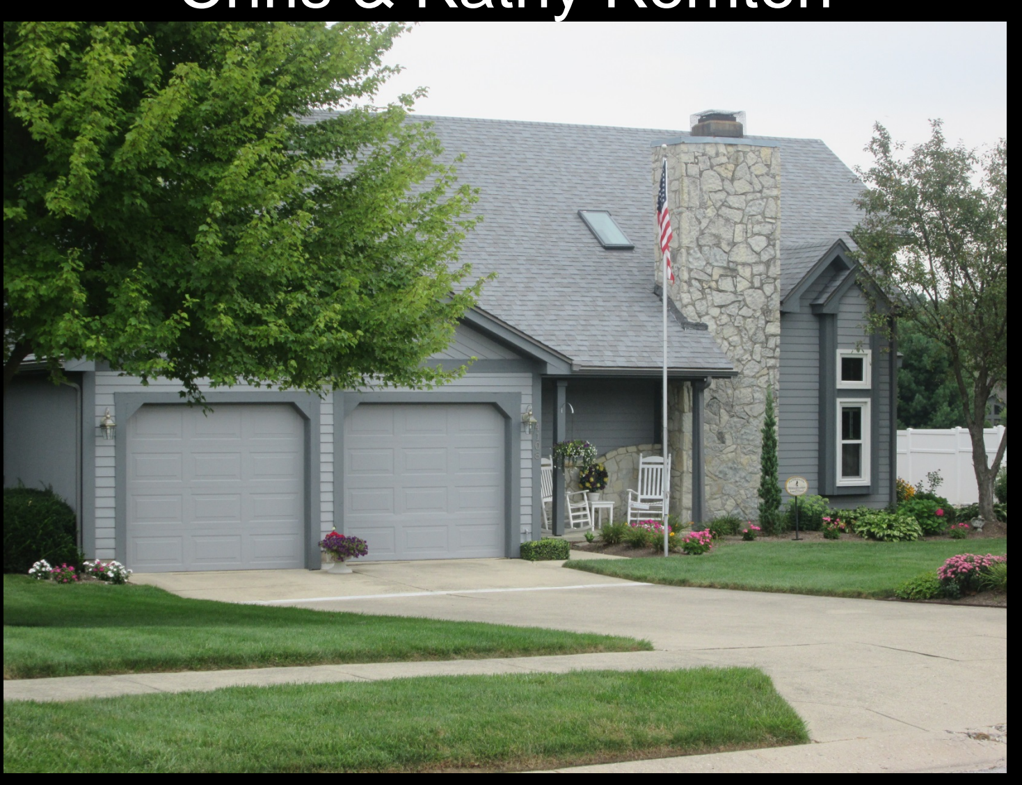
4108 N Linda Drive