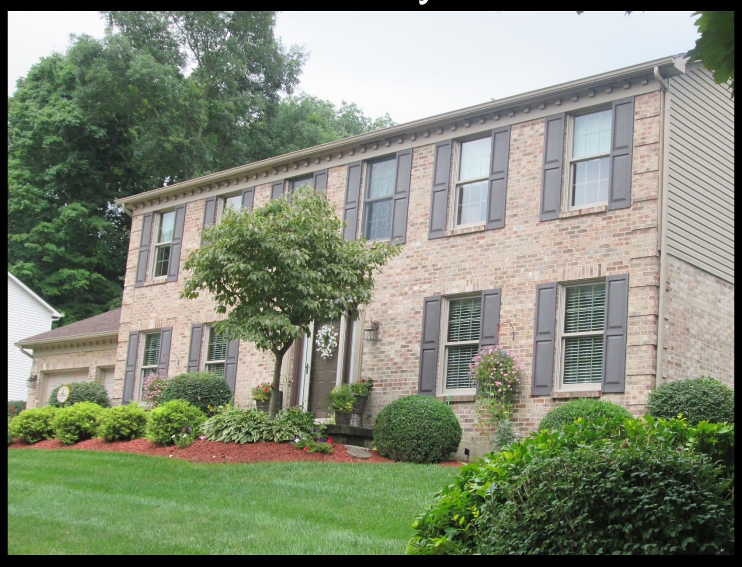
2194 Ivy Crest Drive