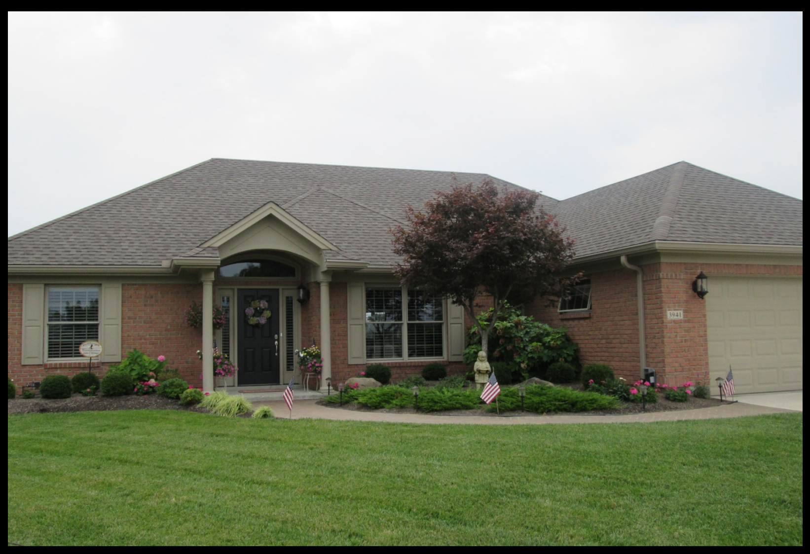
3941 Carmela Court East