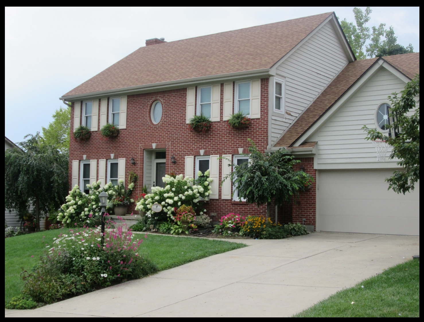
3857 West Sudbury Court