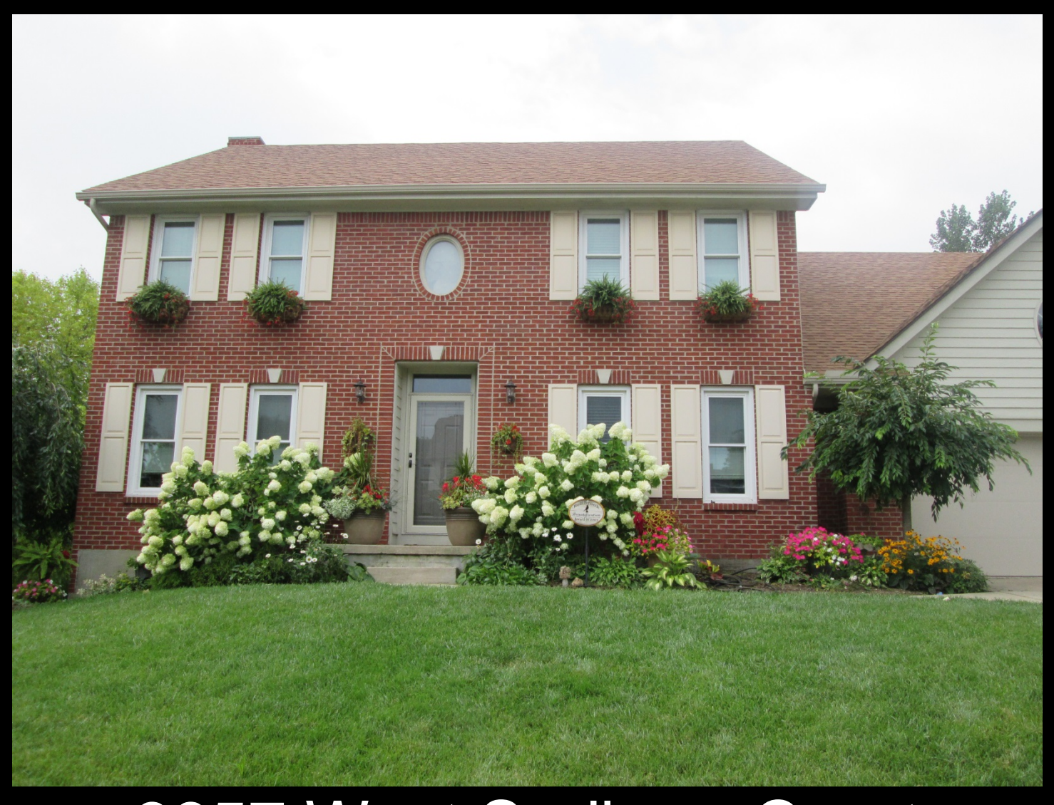
3857 West Sudbury Court