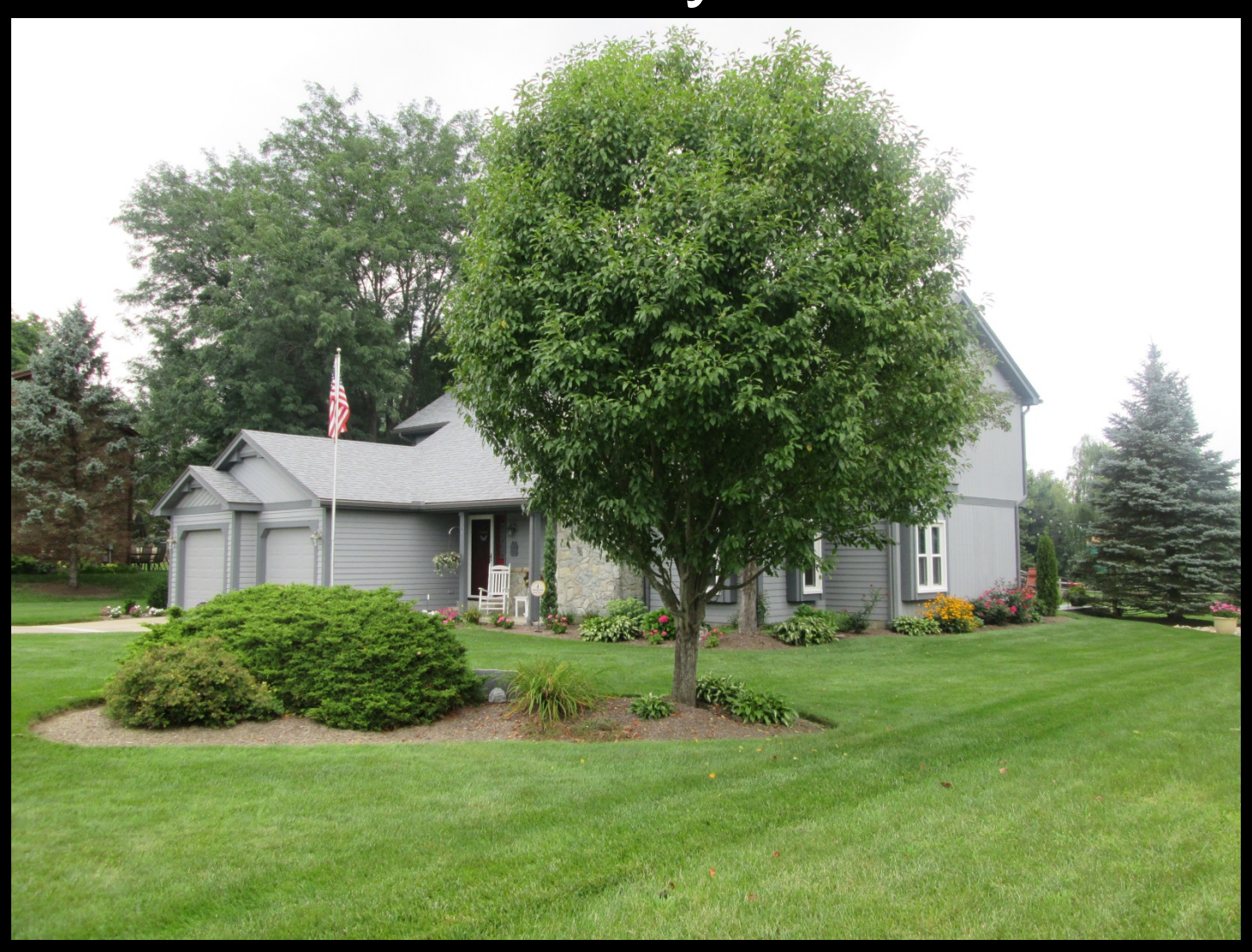
4108 N Linda Drive