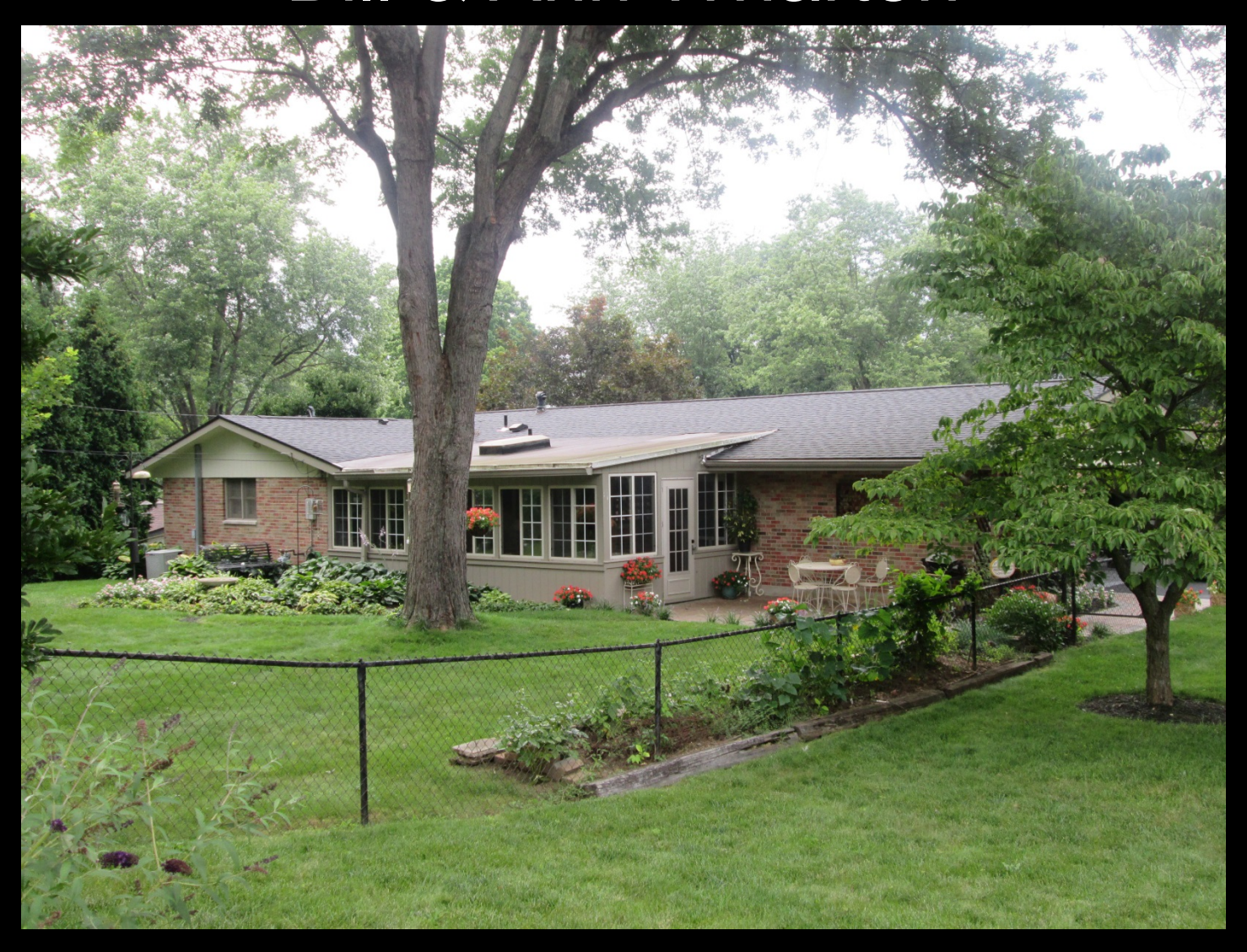
2465 Tennyson Drive