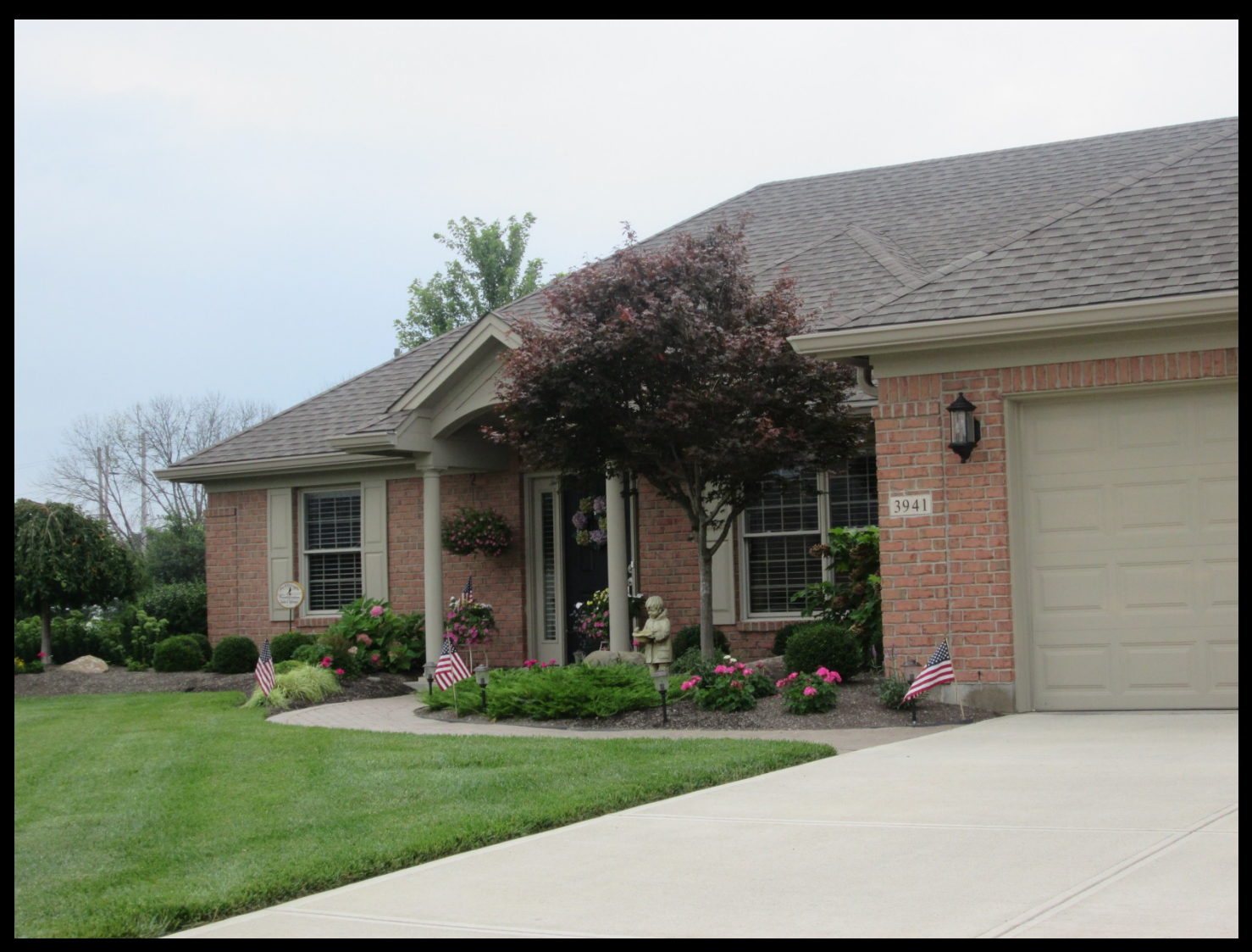
3941 Carmela Court East