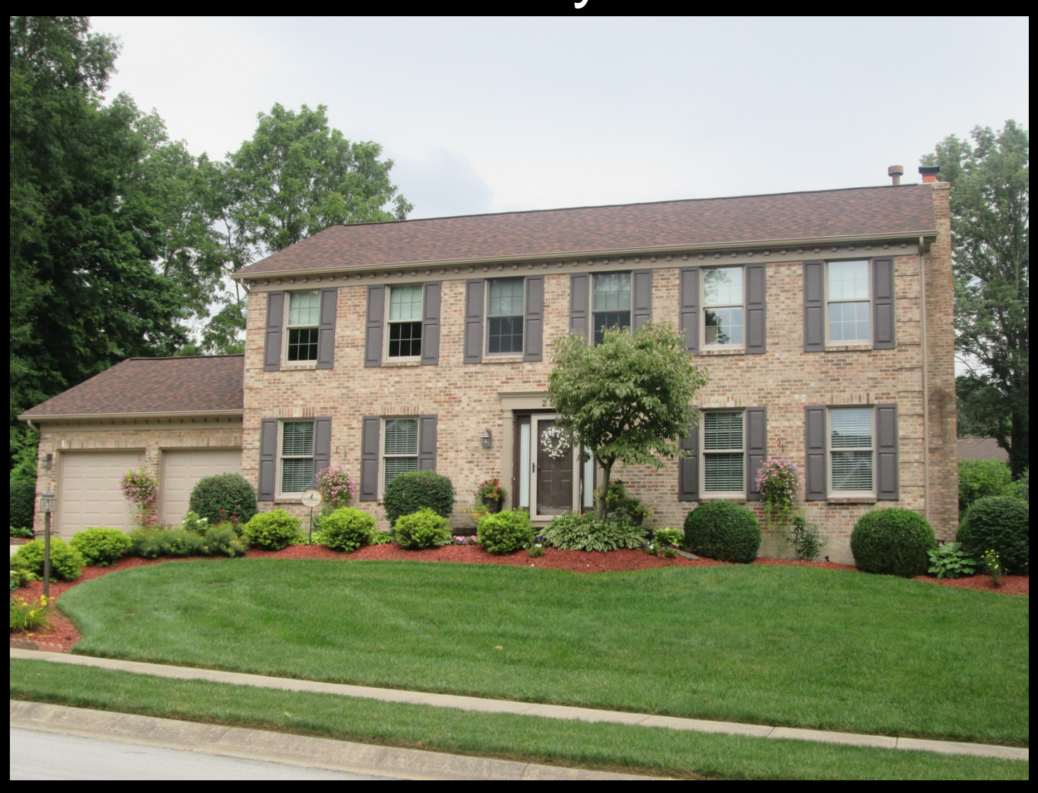
2194 Ivy Crest Drive